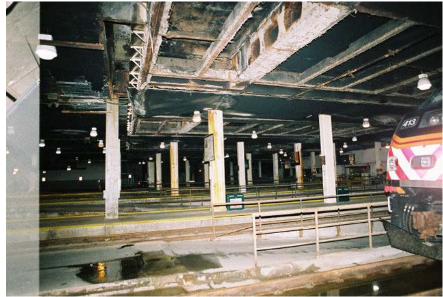
At platform level under Adams St. Viaduct over Union Station