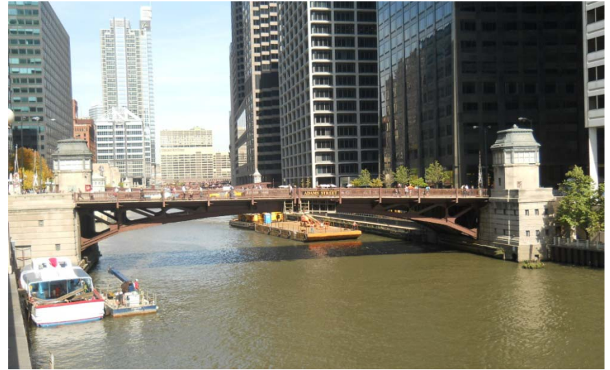
Looking North at Adams St. Bascule bridge over the Chicago River