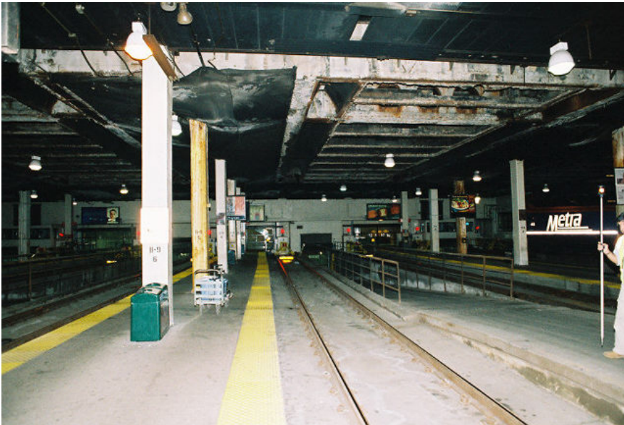
At platform level under Adams St. Viaduct over Union Station