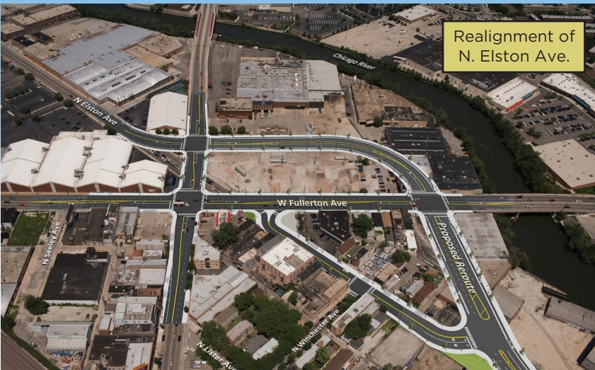
View of Damen and Fullerton Looking North