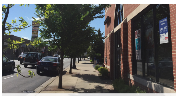
Sites should be seen from the street with sensitive use of both lighting and landscaping to reinforce a sense of place and a well-designed environment