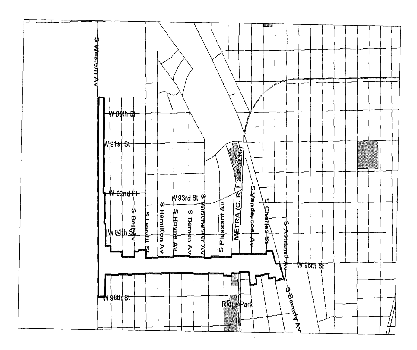
95<sup>th</sup> and Western Redevelopment Project Area 2013 Annual Report