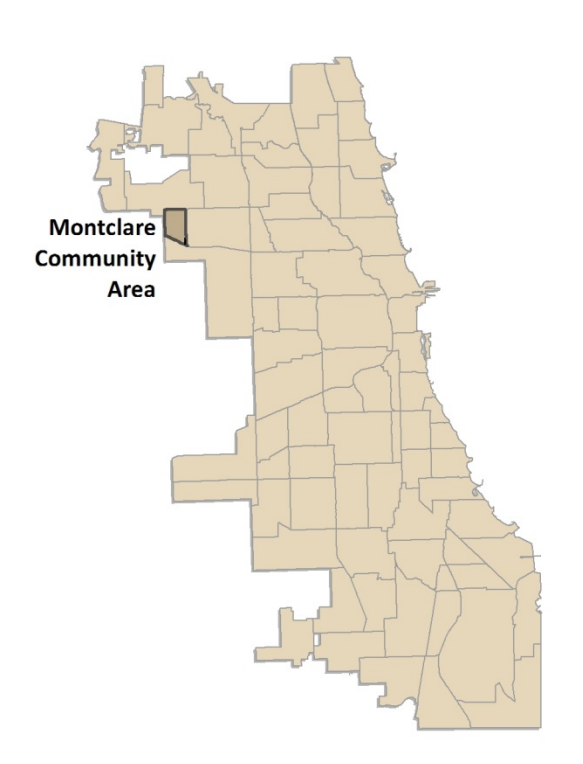
Exhibit 1. Montclare RPA