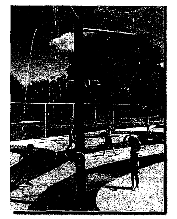
SPRAY FEATURE WATER ODYSSEY SPIN AND SPILL