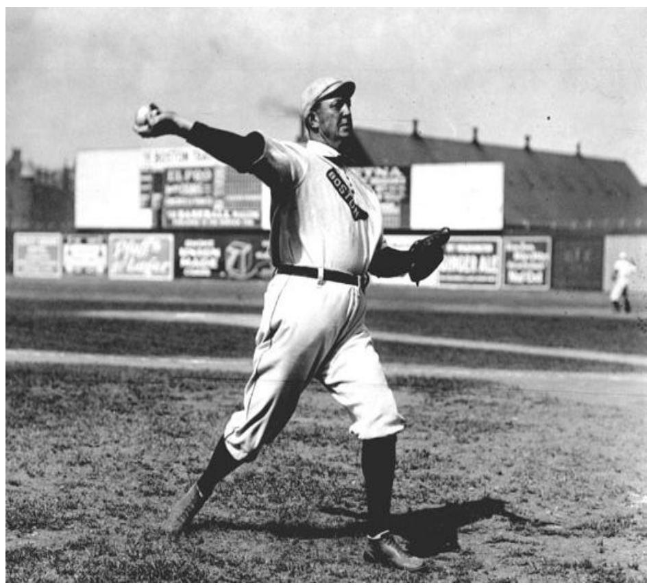
CY YOUNG IN ACTION

Do you wonder what was happening in 1890? That's the year the old water main was installed beneath your street. Among other things: