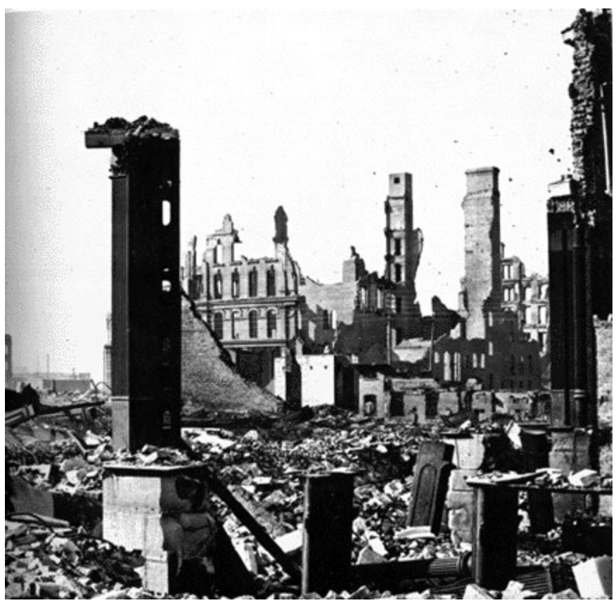
Aftermath of the Great Chicago Fire Corner of Dearborn and Monroe Streets, 1871

Do you wonder what was happening in 1871? That's the year the old sewer was installed beneath your street. Among other things: