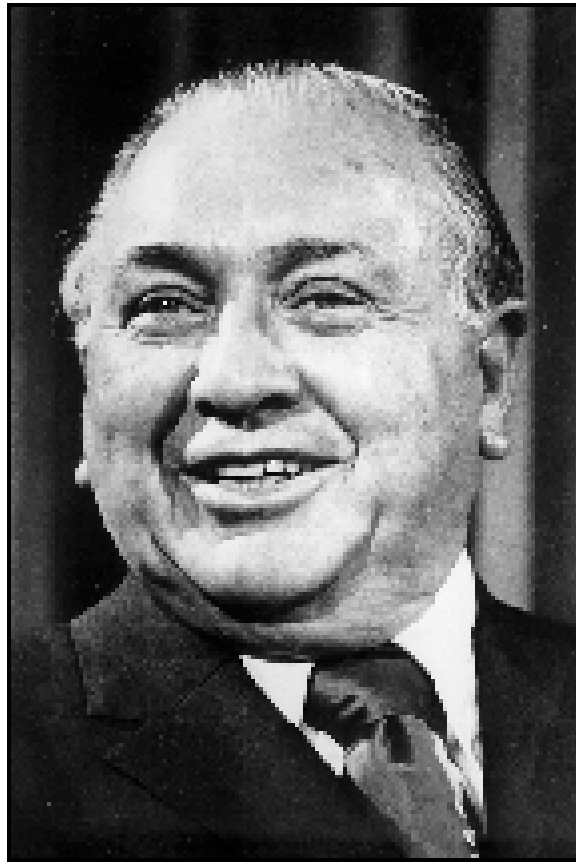
RICHARD J. DALEY

Do you wonder what was happening in 1903? That's the year the old water main was installed beneath your street. Among other things: