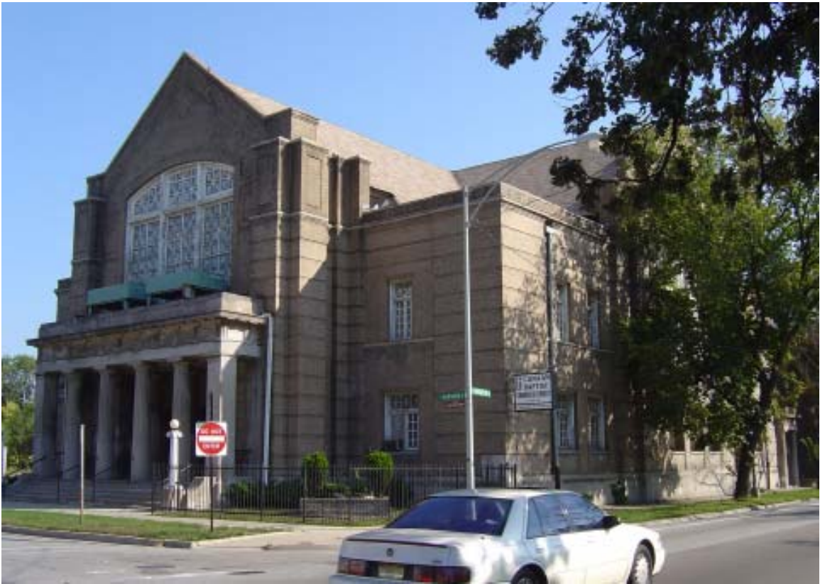
The Canaan Baptist Church of Christ Building has excellent physical integrity. Top: A photograph of the building at the time of construction in 1905. Bottom: The building today.