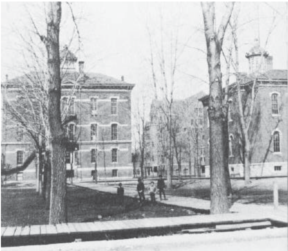
The Englewood neighborhood, where the Canaan Baptist Church of Christ Building is located, originally developed as a railroad suburb south of Chicago before it was annexed in 1889. Top: A view of the community in 1889, looking southwest from approximately W. 63rd St. and S. Yale Ave. Bottom: The Cook County Normal School (seen here between 1888 and 1891) was an important early institution in Englewood. The Canaan Baptist Church Building was built one block north of the Normal School's former campus.