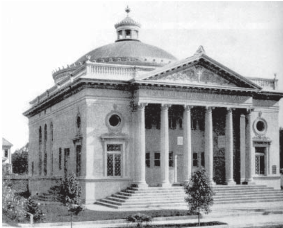
Beman chose the Classical Revival style for the Christian Science church buildings that he designed. Through his ongoing friendship with Christian Science founder Mary Baker Eddy, he encouraged the use of Classicism for the denomination's churches throughout the United States, including (top right) the Mother Church Extension (seen behind the original Romanesque Revival-style Mother Church; (top left) the First Church of Christ, Scientist in New York; and (bottom) the First Church of Christ, Scientist in Los Angeles.