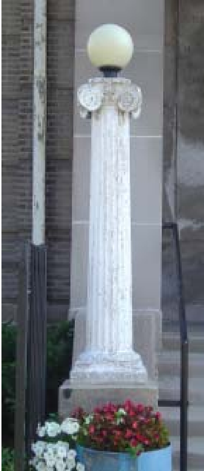
The Canaan Baptist Church of Christ Building has handsome Classical-style detailing, including (left) cast-iron light standards flanking the building's Harvard Ave. entrance; (top right) Roman grillework covering windows; and Doric columns decorating the building's entrances facing (bottom left) Harvard Ave. and (bottom right) Marquette Rd.