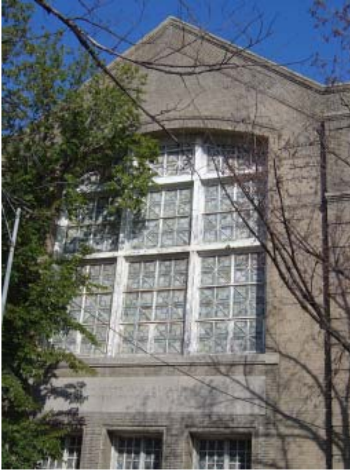
Left: The building's main windows, which light the church auditorium, are detailed with a criss-cross Roman grille motif. Bottom: The main entrance, facing Harvard, is ornamented by large Doric columns and wooden double doors topped with transoms.