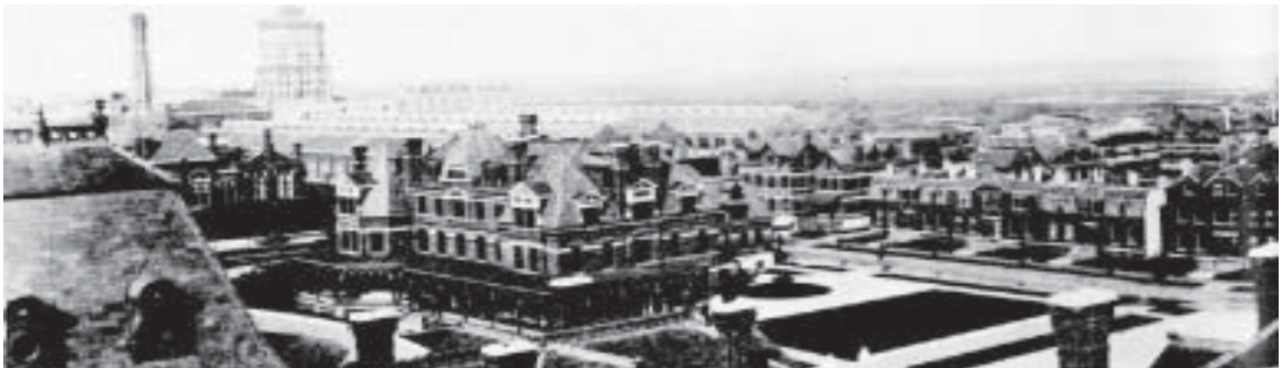
S.S. Beman designed several important buildings in Chicago, including (top left) the Pullman Building on S. Michigan Ave. (demolished) and the Fine Arts Building, also on S. Michigan Ave. (designated a Chicago Landmark). Bottom: He is internationally known for his design of Pullman, the factory town built for railroad car magnate George Pullman (designated a Chicago Landmark District).