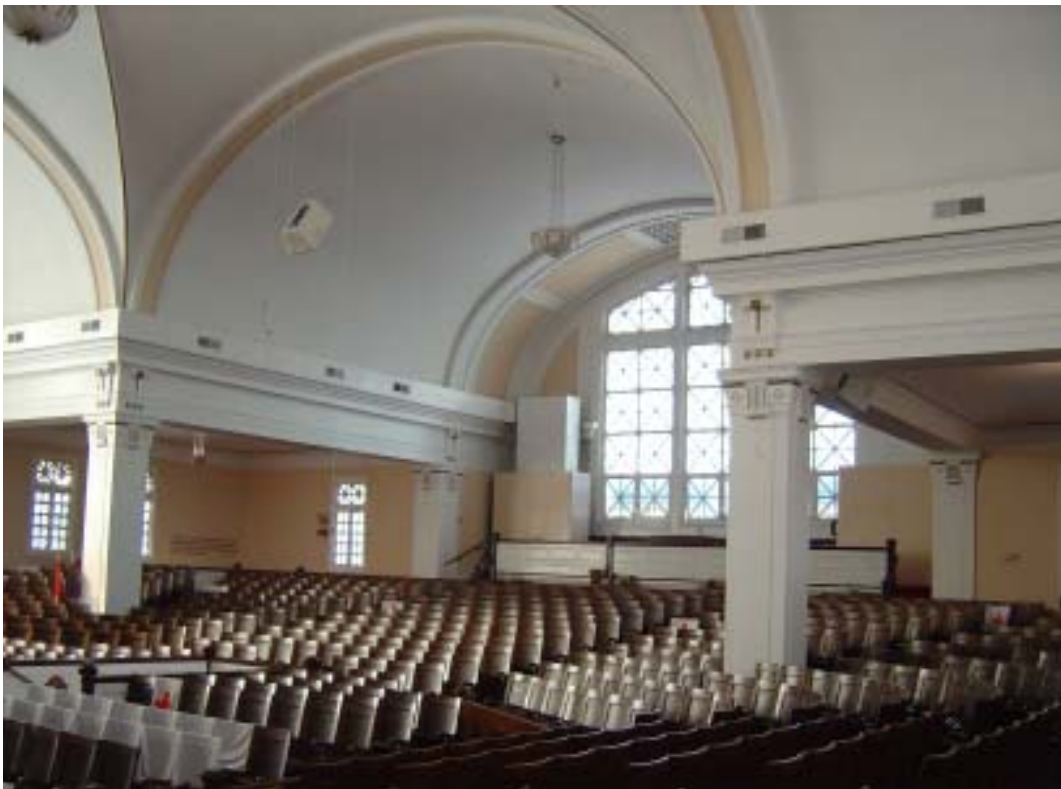
The building's second-floor auditorium is T-shaped with an intersecting barrel-vaulted ceiling and ornamented with Classical piers and moldings.