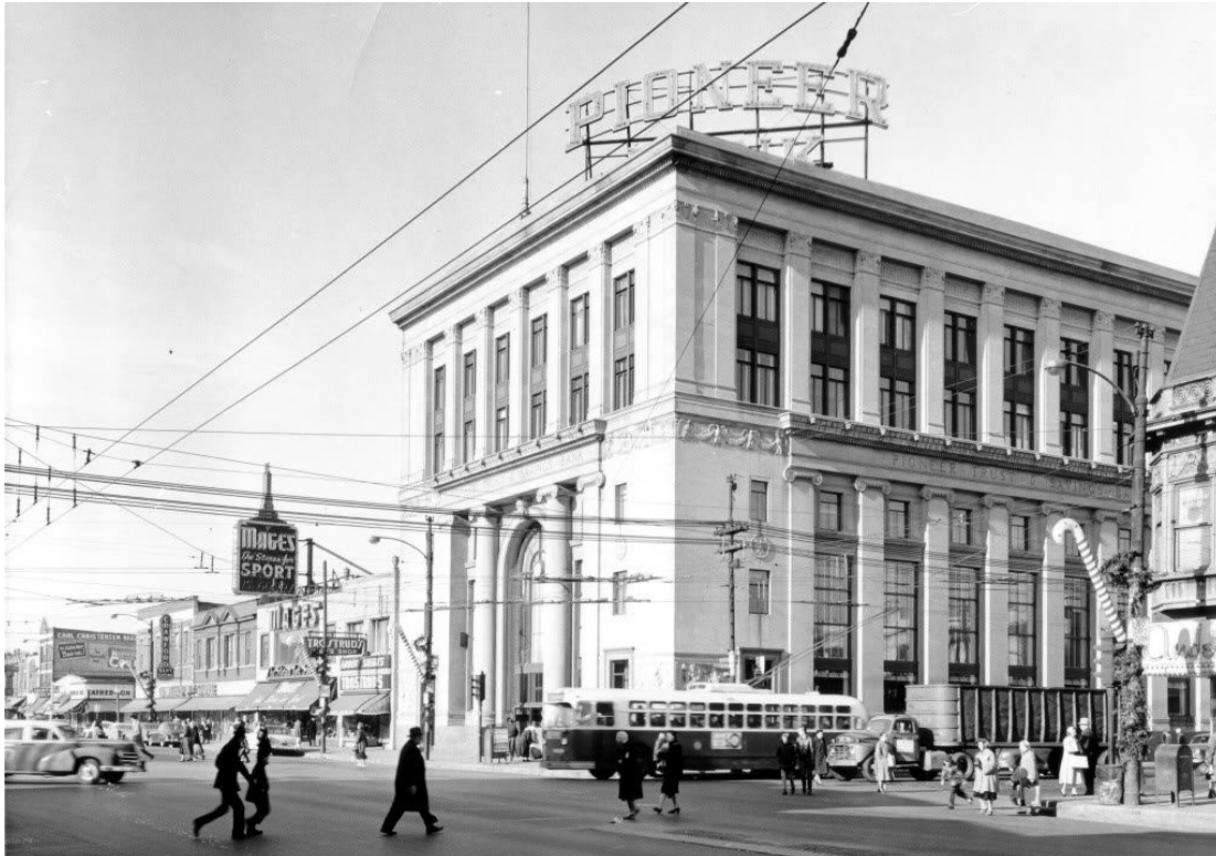
Above: looking northwest from North Avenue toward the Pioneer Bank at Pulaski, circa 1960.