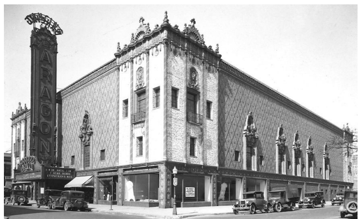
Below: The Spanish Baroque Revival-style Aragon Ballroom, 1927, by Huszagh & Hill, built 1926.