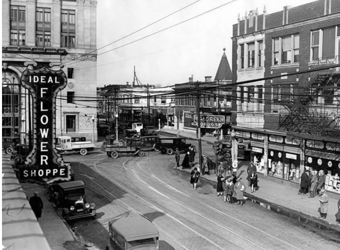
Above: 1928, North and Pulaski, looking north.