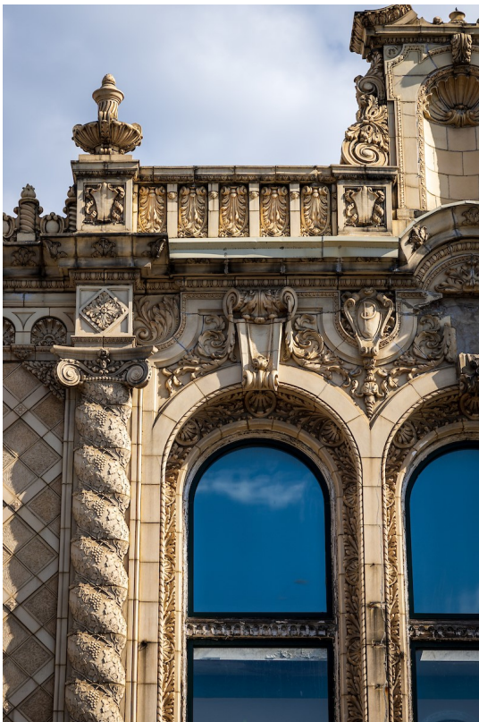
Below left: details of 2nd-floor central bay and parapet. Below right: latticework terra-cotta design at 2nd floor. Bottom right: column capital and decorative lintel.