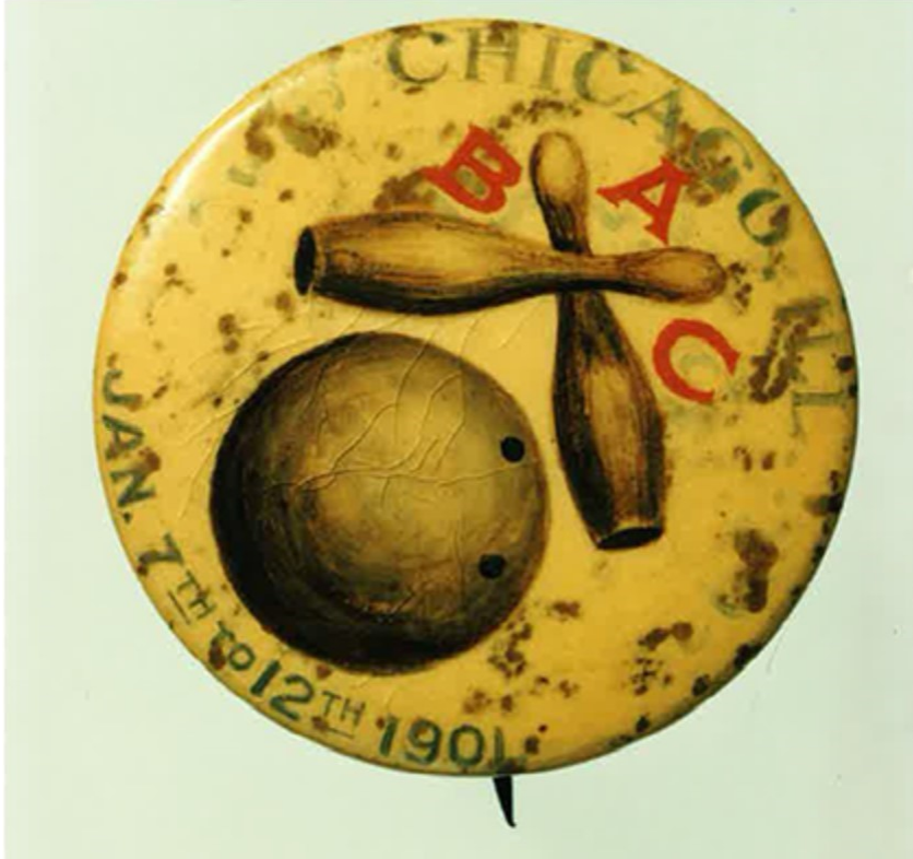
Left: pin from the first American Bowling Congress tournament which took place in Chicago in 1901.