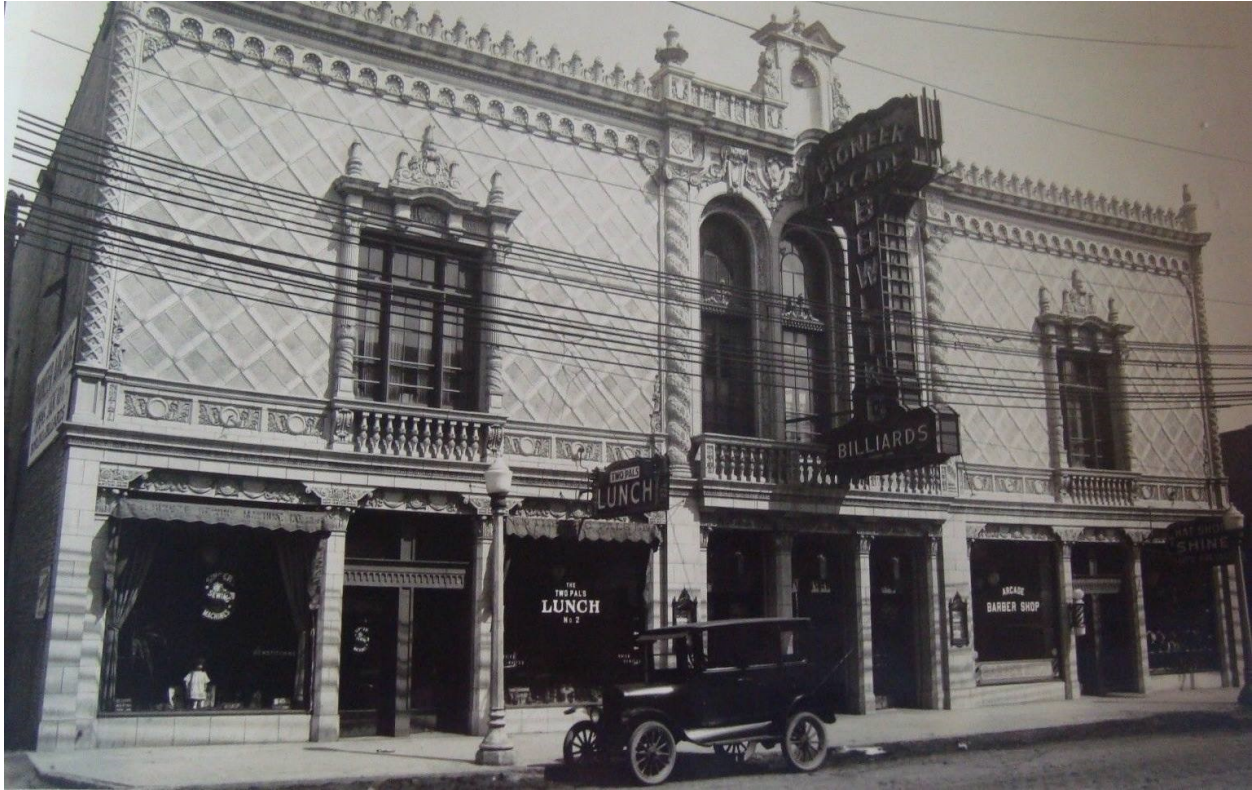
Above: The Pioneer Arcade circa 1927.