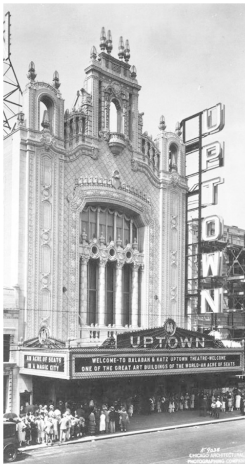
Left: The Spanish Baroque Revival-style Uptown Theater by Rapp & Rapp, built 1925.