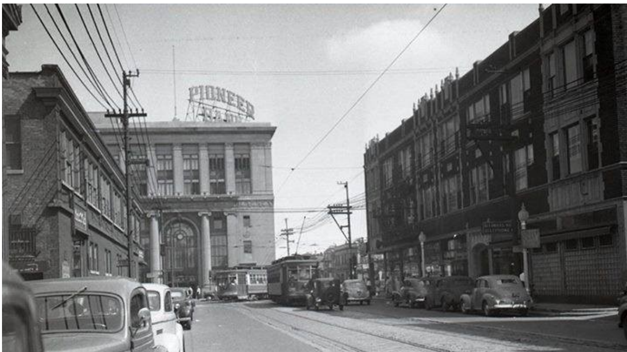
Below: 1947, same intersection as above, with streetcars, looking north.