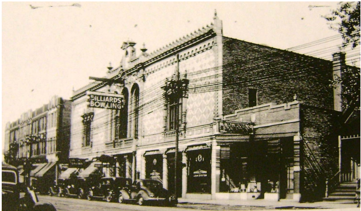
Above: Pioneer Arcade, 1936.