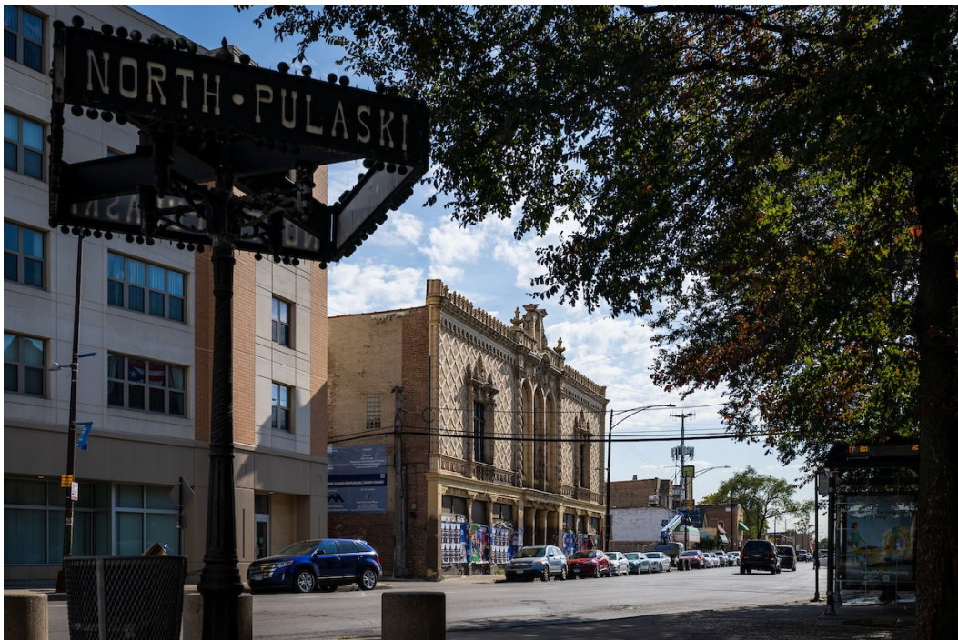
Below: Looking south down Pulaski. The Pioneer Arcade is on the left.