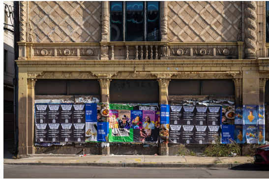
Above left: second floor. Top right: elaborate window hood above balconet, arcaded cornice, and parapet with stylized torches. Above right: north bay of first floor.