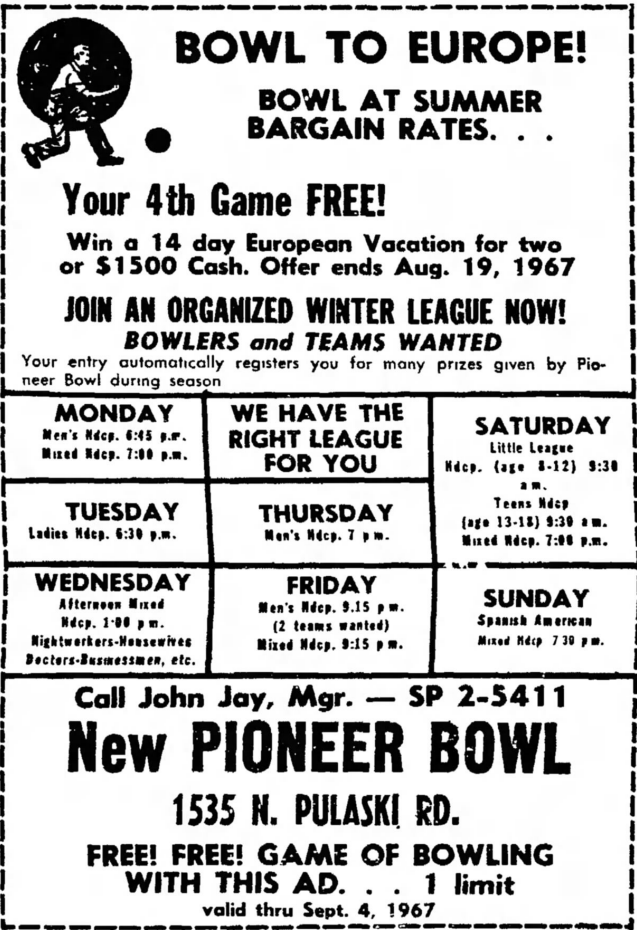
Left: an August, 9, 1967, ad for the New Pioneer Bowl from the Northwest Journal . Sunday night features a Spanish American bowling team, reflecting the changing demographics of Humboldt Park.