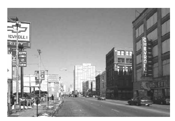
Figure 5.18 The South Michigan-Wabash-State Corridor today.

The newly designated Motor Row Historic District runs along Michigan Avenue concentrated from Cermak Road south to the Stevenson Expressway. The 56 buildings in the district represent possibly the world's largest concentration of early auto showrooms and associated businesses. Motor Row will become a new neighborhood and visitor destination that is home to galleries, nightclubs or restaurants and cultural institutions, with offices or loft spaces above. The area may also serve as an incubator for fledgling museums and arts organizations.