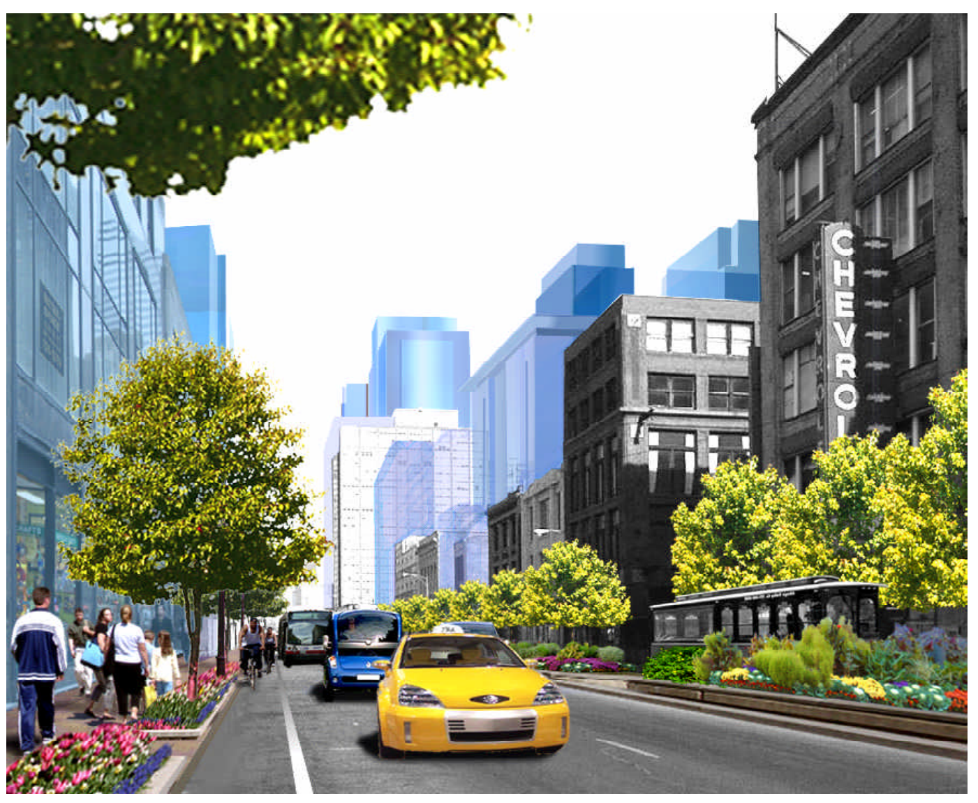
Figure 5.19 The South Michigan-Wabash-State Corridor in 2020. Motor Row will become a new neighborhood and visitor destination.