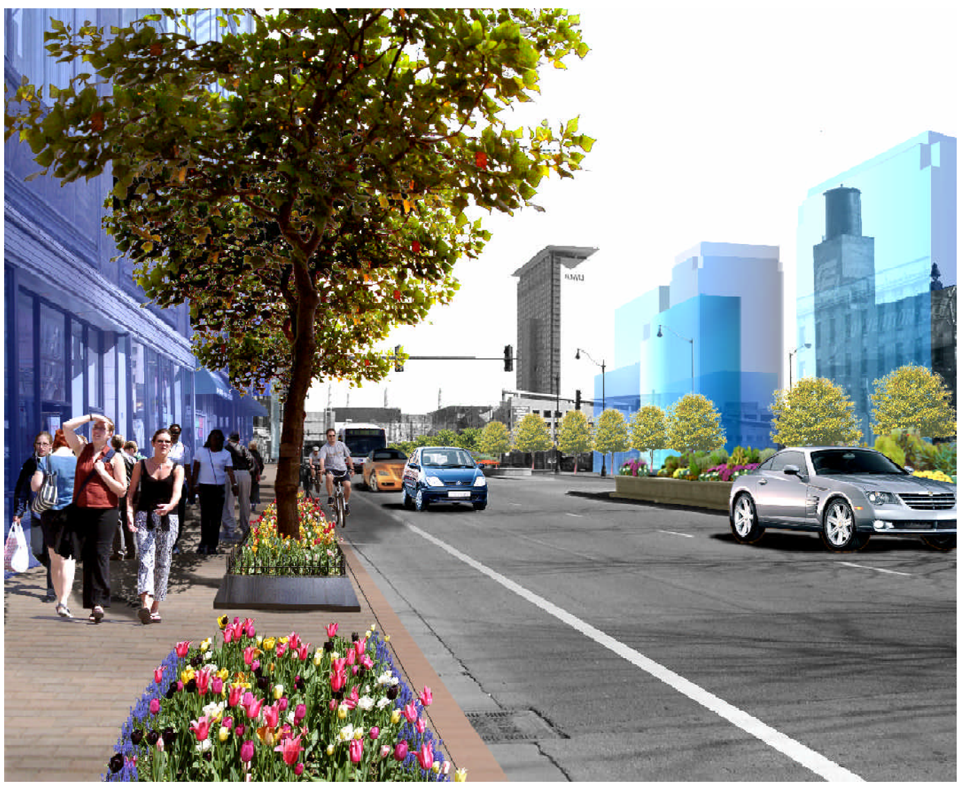
Figure 5.22 The Cermak Road Corridor in 2020. Cermak Road will be developed as a high-density mixed-use corridor linking Pilsen and Chinatown to McCormick Place and the Lakefront.