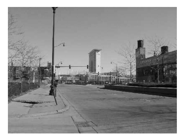
Figure 5.21 The Cermak Road Corridor today.

The new Cermak Elementary School and Teacher's Academy is a major asset for the community. It includes a new neighborhood park and community center. Chinatown will continue to thrive as a distinctive residential community and a long-standing visitor destination.