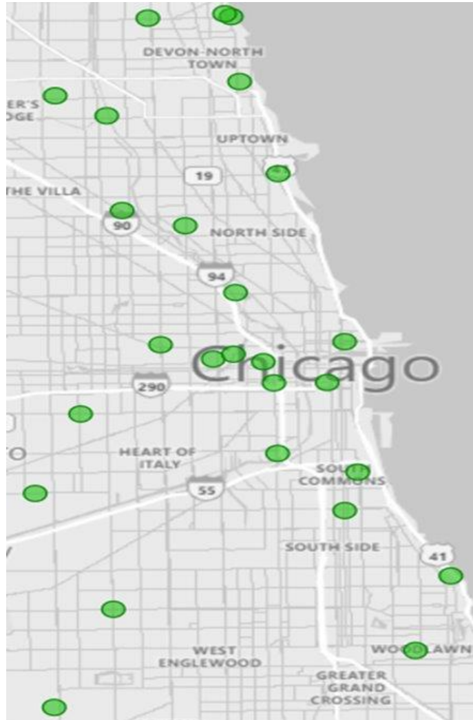
New Arrivals Shelter Map