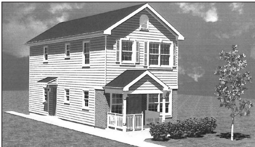
Englewood Estates will create 15 new affordable single-family homes at scattered sites throughout the West Englewood community of the 15th Ward.

The City is providing the land and $75,000 in site improvements to the developer along with $600,000 in financial assistance to buyers so the homes can be sold at affordable prices. City assis-