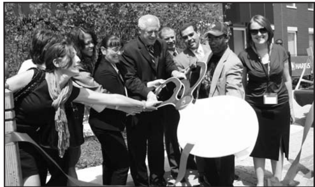
Governor Pat Quinn cuts the ribbon at the grand opening of the Rosa Parks Apartments in the 27th Ward's Humboldt Park community. This development has created 94 new units of affordable housing for Chicago residents

In June DCD officials joined community leaders, members of the development team and others in celebrating the grand opening of Rosa Parks Apartments, a new 94-unit affordable rental development located in the area bounded by Kedzie and Drake avenues, Huron Street, and Franklin Boulevard in the Humboldt Park community of the 27th Ward.