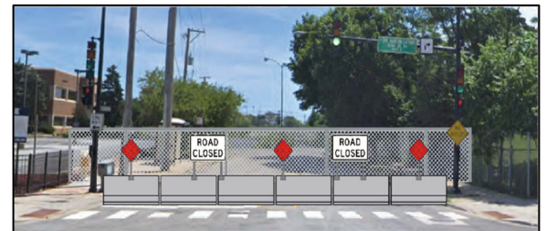
Proposed concrete barriers and fencing blocking pedestrian access to the north walkway leading to the 27 th Street Metra Station.

(See Metra Station pedestrian access map to the left. )