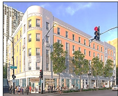
City financing preserved the Mark Twain Apartments as an SRO in 2018.

To qualify for City assistance, developers must first secure private construction financing. SRO preservation funding can then be tapped to convert these loans to permanent mortgage financing with monthly payments cut by 50%.