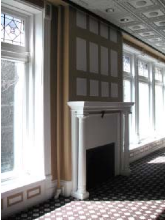
Above: an original carved-wood mantel piece, wainscoting, and original windows in a former club room on the mezzanine level.