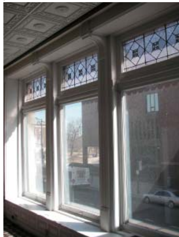
Below: windows on the mezzanine level include leaded art glass transoms, original pivot casements, and carved mullions.