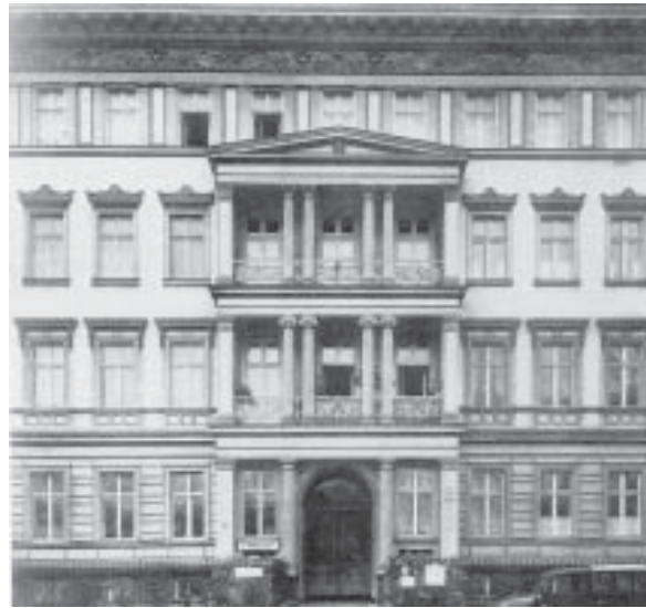
Above: A circa 1860 residence in Berlin in the German Neoclassical style of architecture. The design of the Germania Club incorporates features of this style, including the banded treatment at the base, the projecting pediment, the pronounced entrance, and the ornamental frieze and cornice.