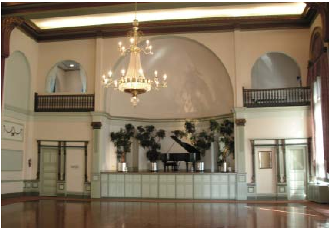
Above: The main dining room at the Germania Club was designed to accommodate 400 persons. The elevated stage, with its half dome, is the focal point of the room.