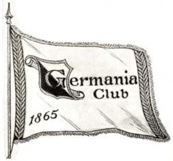
Germania Club Flag.