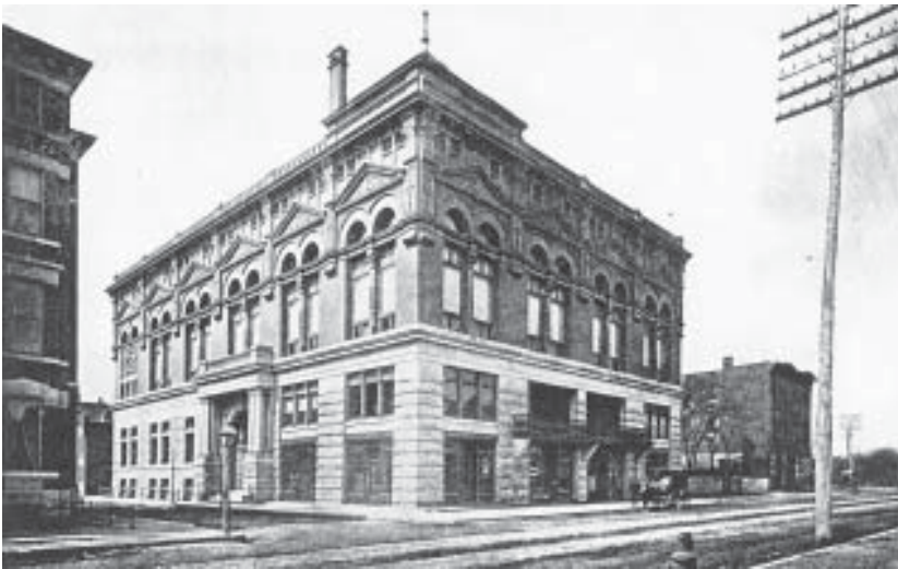
Left: A very early photograph of the building published in 1900 in a collection of 100 photographs of Chicago. The original configuration of the open porch is visible on the Clark Street elevation.