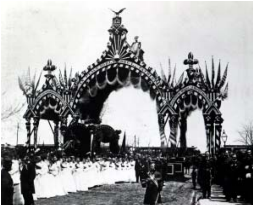
The Germania Club traces its roots to a men's chorus made up of German-American Civil War veterans who sang at President Lincoln's funeral ceremonies in Chicago. Left, the funeral procession enters Chicago's courthouse on May 1, 1865.