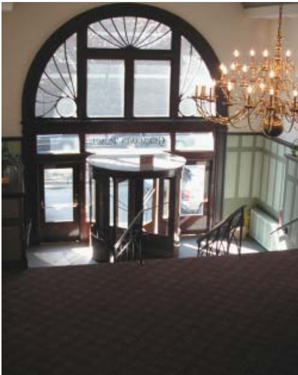
Below: Part of the grand stairway which travels from the street-level entrance to the third floor gallery level.