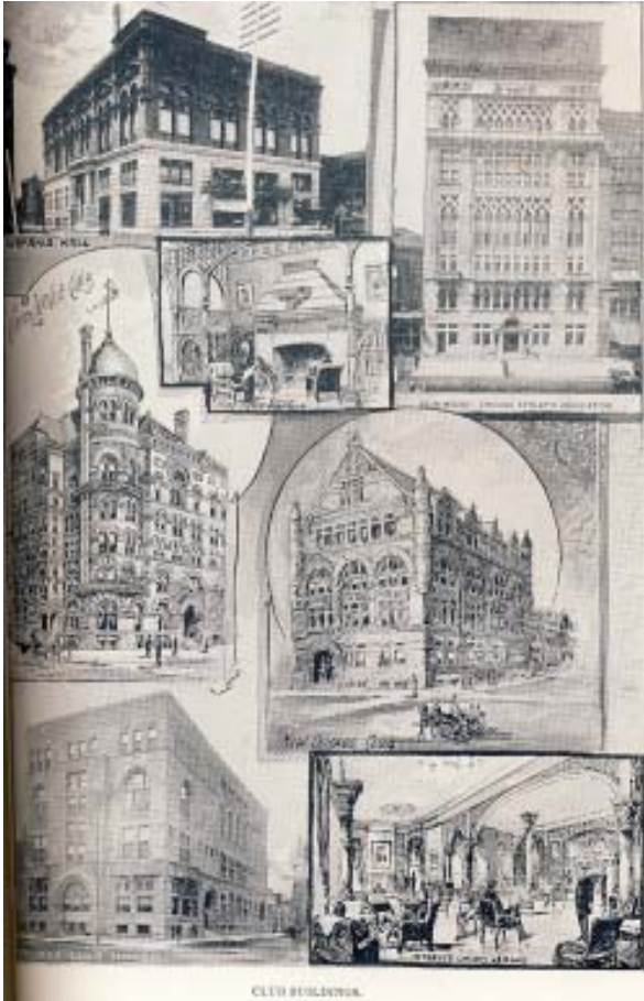
Left: A history and guide to Chicago published in 1895 described the Germania Club Building as "one of the handsomest [clubs] in Chicago." It is illustrated with the Chicago Athletic Association, the Standard Club (demolished), and the first Union League Club Building (demolished).