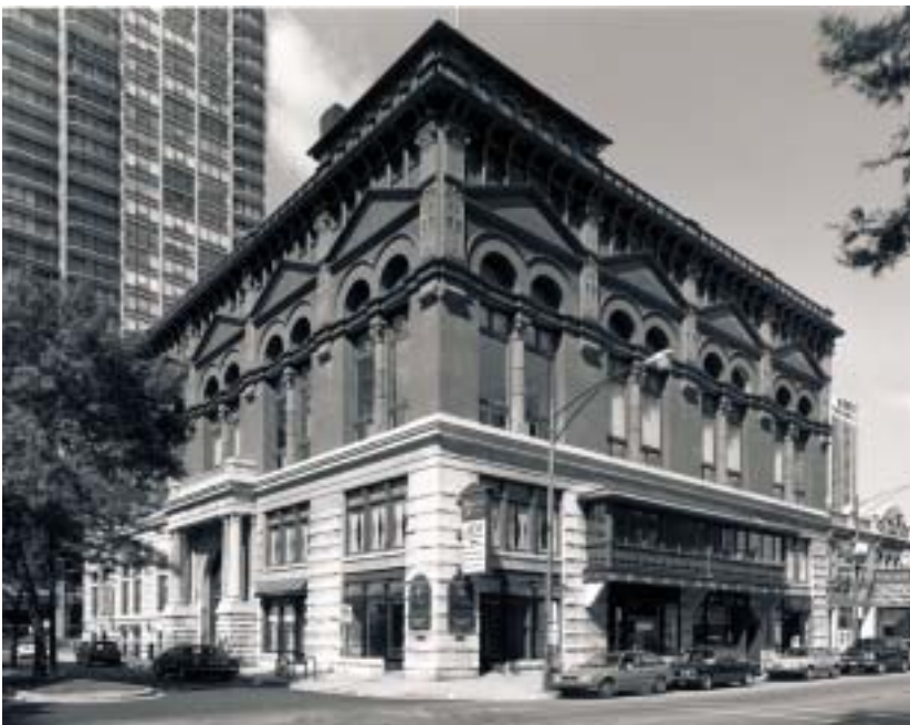
Left: A 1996 photograph of the building, unchanged from how it appears today.