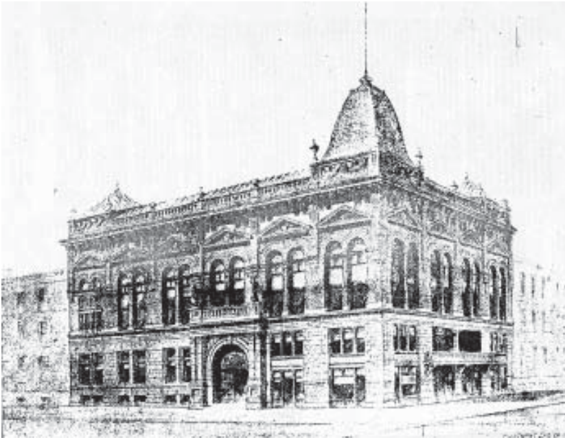
Left: A pre-construction rendering of the Germania Club Building was published in the Building Budget in 1888. The bell-cast roof and parapet finials were not constructed as part of the final design.