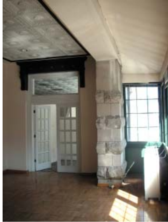
Above: The masonry pier and heavy door frame of the formerly open porch, now enclosed on the mezzanine level.