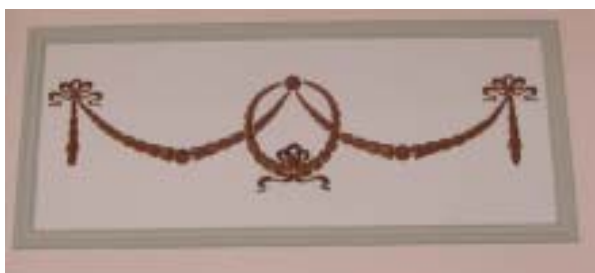
Left: Historic details in the dining room including wood wainscoting, interior doors, and trim, and garlands in ornamental plaster.