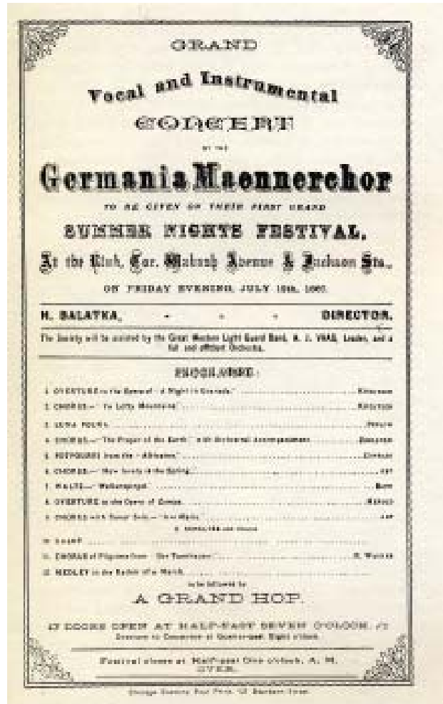
Right: The program for a summer concert by the Germania Männerchöre in July 1867 included 12 works by German composers performed by the chorus and an orchestra. The evening was to conclude with a "grand hop" until 1:30 a.m.