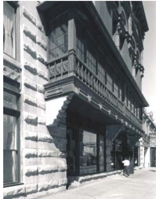
Top left, left and above