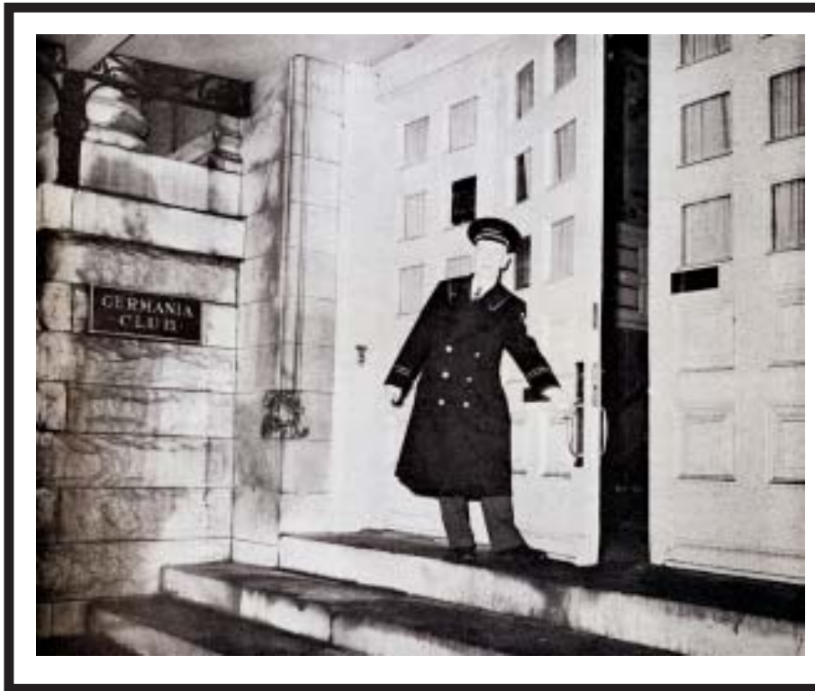
The entrance to the Germania Club Building (the original front doors have since been replaced).

For all identified interior spaces, the light fixtures are not historic and are excluded from the designation.