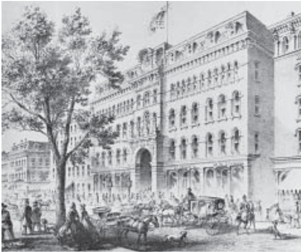
Above: From the 1860s through the 1880s, the Germania Männerchöre performed at various locations throughout the city, including Crosby's Opera House. The club remained without a building of its own for the first 25 years of its existence.