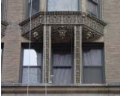
Jenney's earliest surviving skeleton-frame buildings are (below) the Second Leiter Building (built as a department store building and for years the Sears, Roebuck & Co. Department Store) at State St. and Congress Pkwy. and (right and above) the Manhattan loft manufacturing building at Dearborn St. and Congress Pkwy., both completed in 1891. Both are designated Chicago Landmarks.