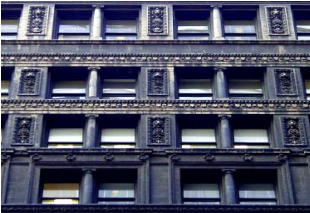
The New York Life Building’s upper four floors are ornamented with Classical-style attached columns, moldings, and foliate-detailed panels executed in terra cotta. Of these, the lower two floors are part of the 1893-94 original building, the third floor was added in 1898, and the top floor was added in 1903.