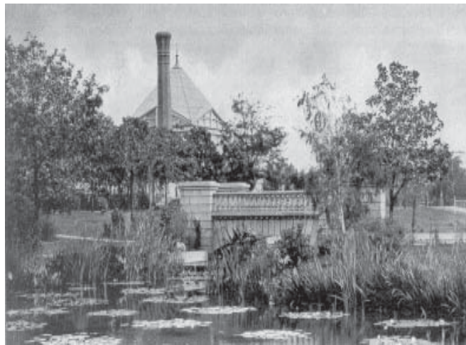
Left: William Le Baron Jenney, the designer of the New York Life Building. Jenney achieved early praise in Chicago in the early 1870s as the designer of the original layout and buildings in Humboldt, Douglas, and Garfield Parks on Chicago's West Side.