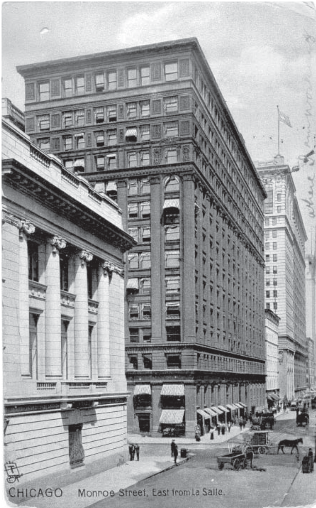
A postcard view of the New York Life Building after the building's top floor was added in 1903.