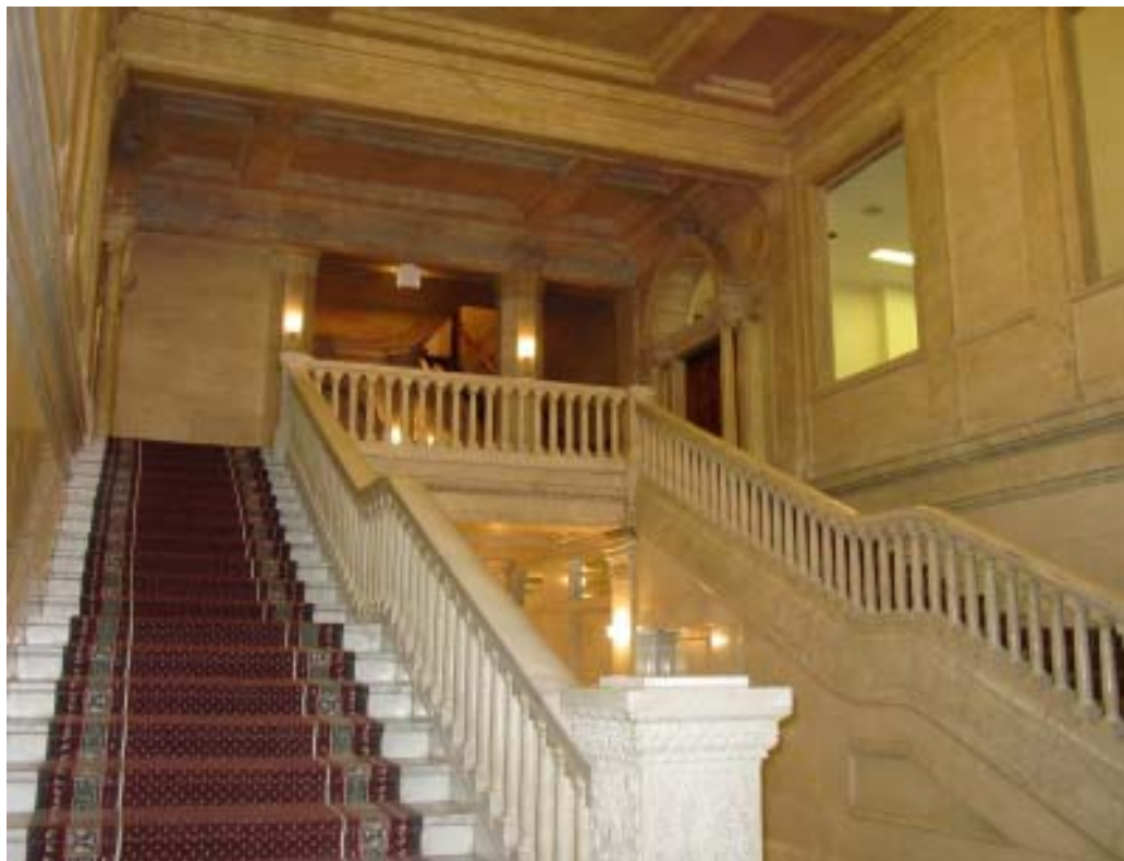
The New York Life Building's lobby is clad with gray marble and detailed with panels and Classical-style moldings. Above: The two-story-high LaSalle Street portion of the lobby with its pair of marble staircases. Top: One of the Palladian "triumphal-arch" surrounds on the second-floor landing leading into the building's former New York Life offices.