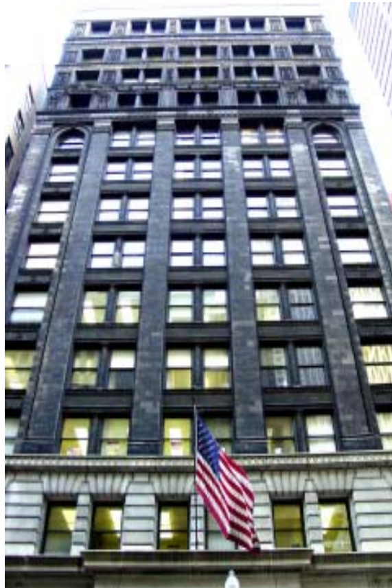
Right: The New York Life Building's upper floors clearly express the building's underlying steel frame through projecting piers and recessed spandrels. Above: The building's third floor is clad with rusticated granite. Attached columns ornament paired windows on upper floors. Top: The top floors are detailed with Classical-style moldings, pediments, and panels of foliate ornament.