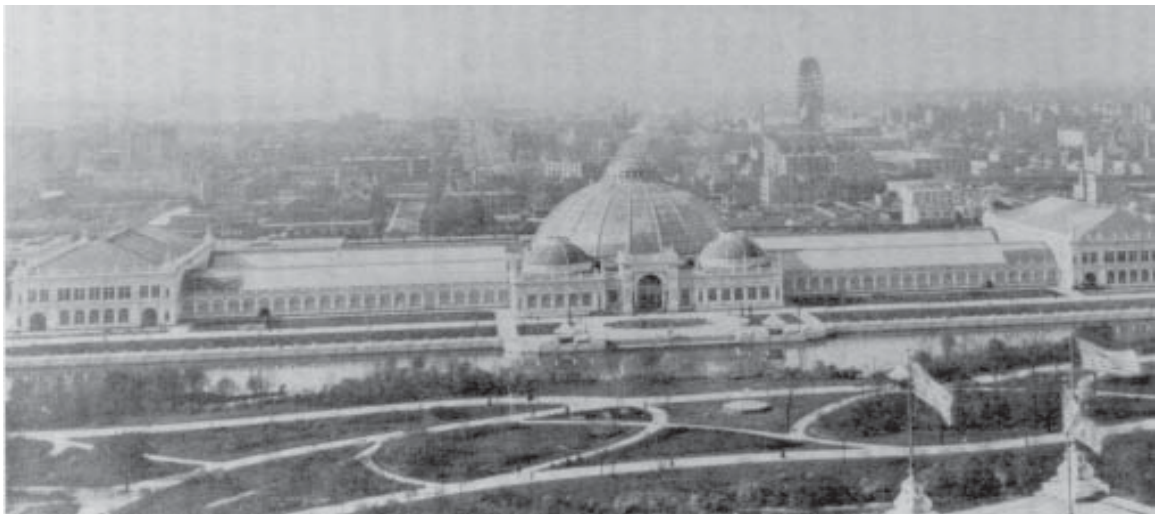
Top: Jenney was a member of the architectural advisory team for the 1893 World's Columbian Exposition, held in Chicago's Jackson Park. The fair's Classical-style architecture influenced Jenney's later work, including the New York Life Building.