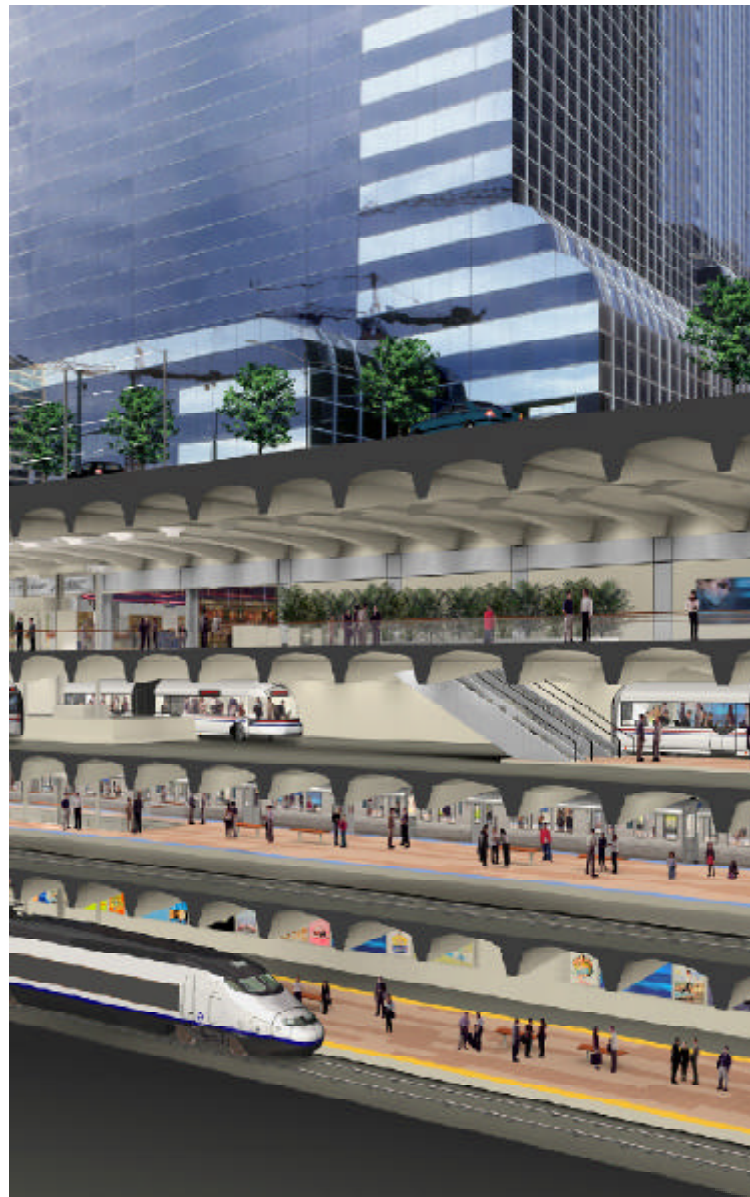
Figure 3.4 Ensure transit and inter-city access to the Central Area to provide a clear alternative to driving.