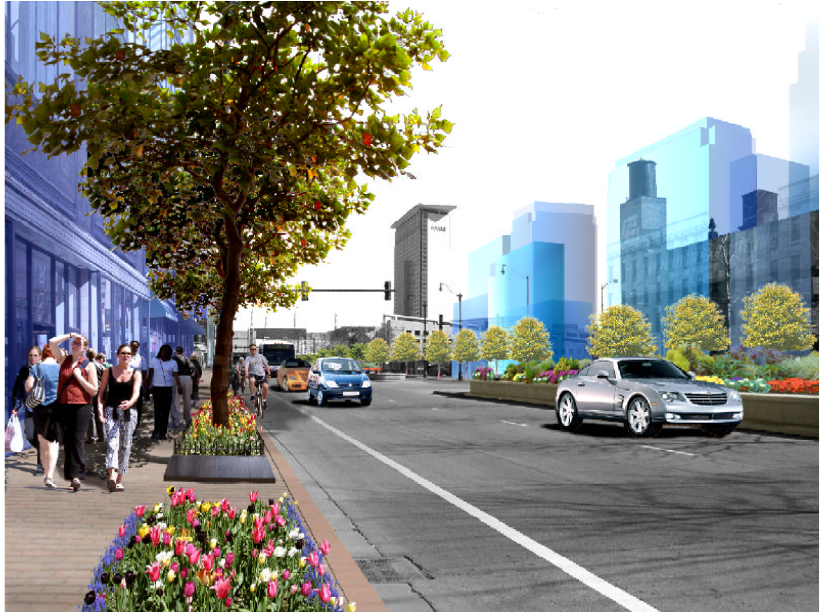
Figure 3.2 Cermak Road will become a higher density corridor connecting McCormick Place, Motor Row, Chinatown and the new neighborhoods in the Near South Side district.