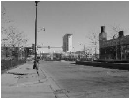
Figure 3.1 Cermak Road today