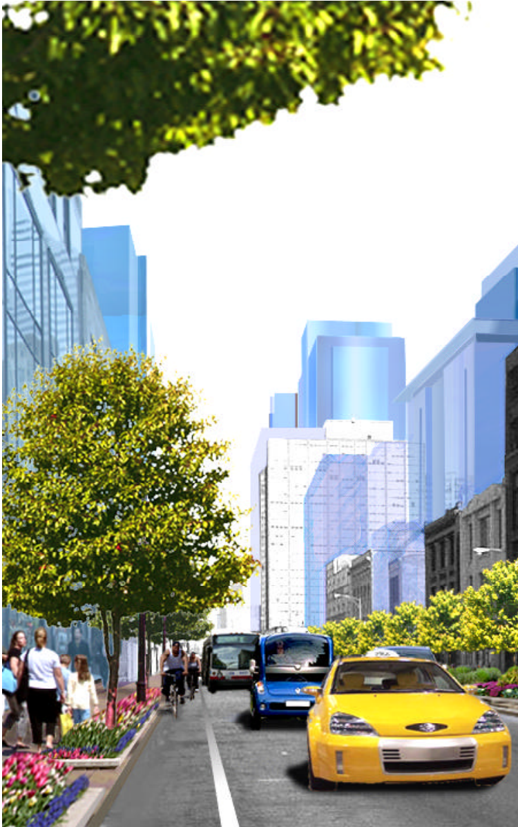
Figure 3.3 Encourage the development of a new generation of energy efficient buildings and infrastructure.