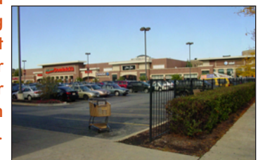
New housing developments in the Mid South (top), a historic church and a new mixed use building in the Near West (center), and a newer commercial center in the Near North (bottom).