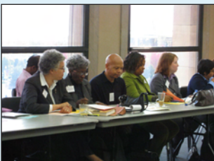
Mid South Project Kickoff Meeting

The Reconnecting Neighborhoods project convened public meetings and used a wide variety of techniques to solicit community feedback, including key pad polling and group mapping exercises.