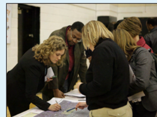
Near West Community Meeting