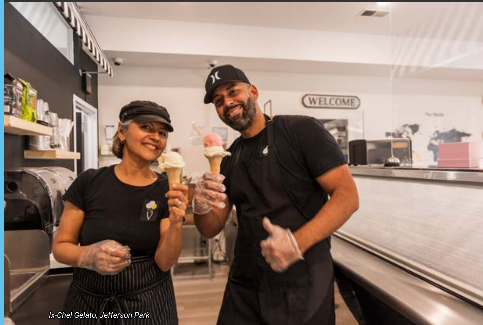
Ix-Chel Gelato, Jefferson Park