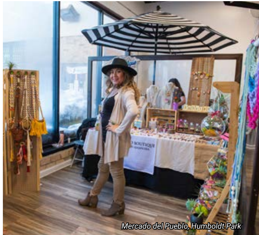
Mercado del Pueblo, Humboldt Park

SBIF program participants can receive grants covering between 30 percent and 90 percent of eligible project costs.