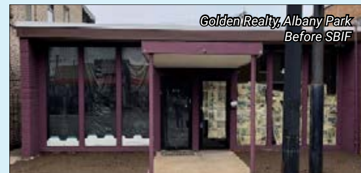
Golden Realty, Albany Park Before SBIF

Applications and additional information are available at www.chicago.gov/sbif . The site can be translated from English by using the dropdown menu in the upper-right corner.