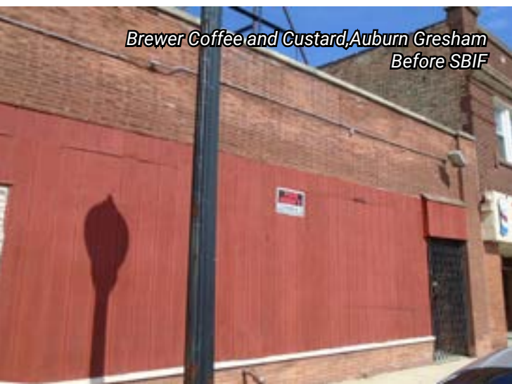
Brewer Coffee and Custard, Auburn Gresham Before SBIF