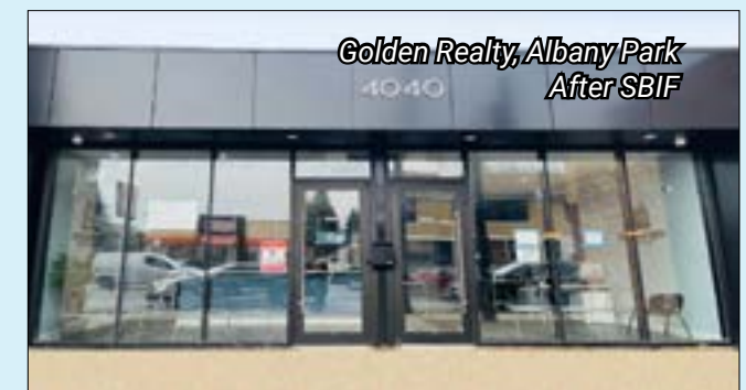
Golden Realty, Albany Park After SBIF