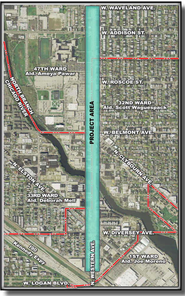
*Map Shows 2015 Ward Boundaries

Through public involvement received at these meetings, the project team reviewed input from stakeholders, studied and evaluated alternatives, and expanded the study through the development of a <u>corridor improvement concept</u> to fully address the various concerns.