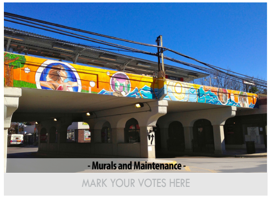
■ GOAL 2: Improve access from neighborhood to the Transit Center for all users