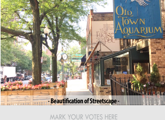
■ GOAL 1: Improve walkability along key streets in the study area