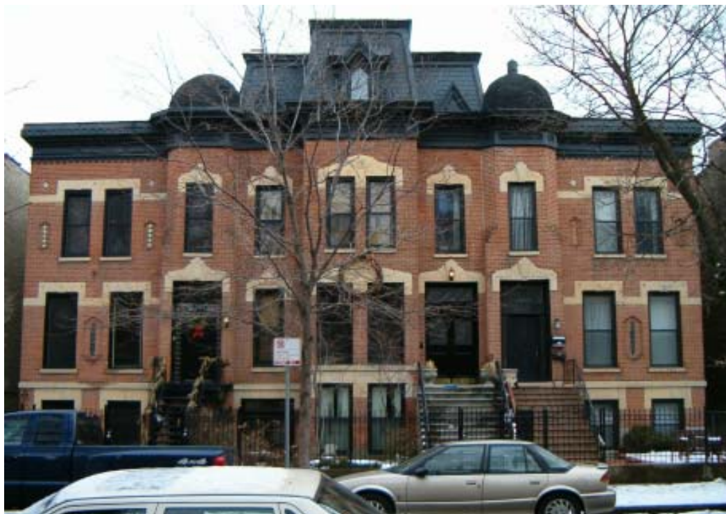
Top: The Bissell Street District is an unusual architectural “setpiece,” consisting of two nine-flat buildings, centrally located on both sides of the block, which are flanked by a variety of smaller six- and three-flat buildings. Bottom: One of the District’s nine-flat buildings, with its striking, Second Empire-style mansard roof.