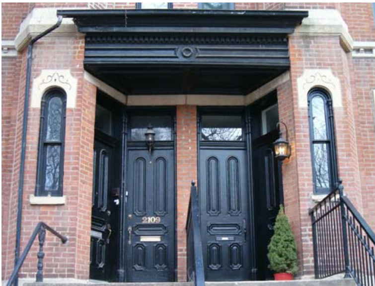
A selection of details from the Bissell Street District.