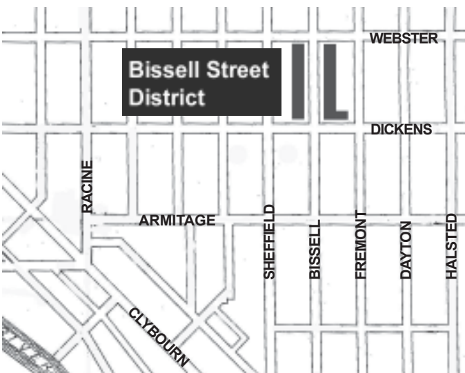
Left: The Bissell Street District is located in the western part of the Lincoln Park community area commonly known as the Sheffield neighborhood. Top and middle: The district consists of 20 buildings lining both sides of the 2100-block of N. Bissell St., between Dickens and Webster Avenues.