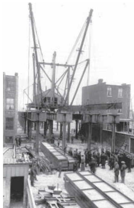
During the 1890s, the Northwestern Elevated Railroad Company built the North Side elevated railroad immediately to the west of Bissell. Top: Historic photo of the elevated tracks looking north from Armitage. Bottom left and right: Construction photographs of the elevated railroad (now the Chicago Transit Authority Red and Brown Lines).