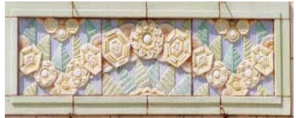
The Veseman Building has unusual polychromatic terra-cotta detailing in a variety of colors, including baby blue, light and dark green, indigo, and beige.