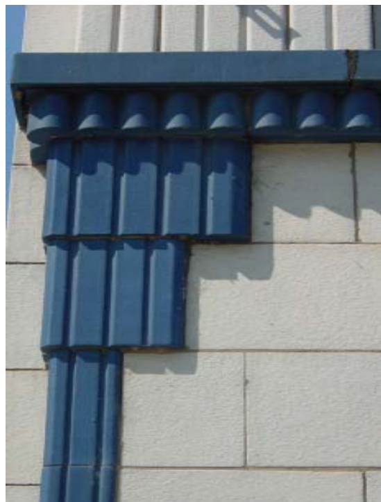
Additional details of the Veseman Building's terra-cotta ornament.