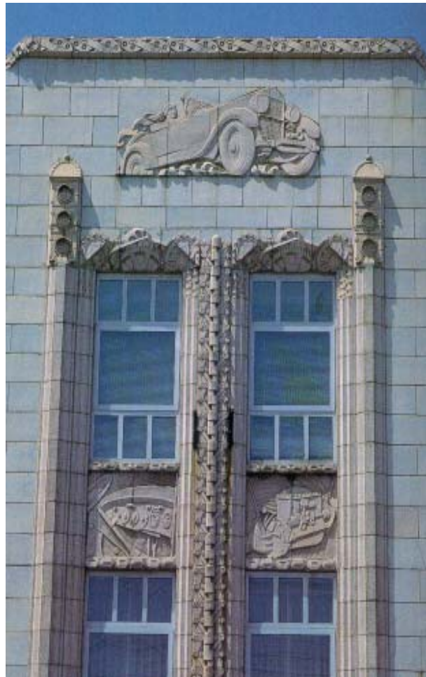
Other examples of polychromatic terra-cotta buildings from the 1920s found throughout the United States, including (top) Bickford's Restaurant building in New York; (above) the building at 3027-29 Troost Ave., Kansas City, Missouri; and (right) the former Hyde Park Chevrolet Showroom, Chicago, IL