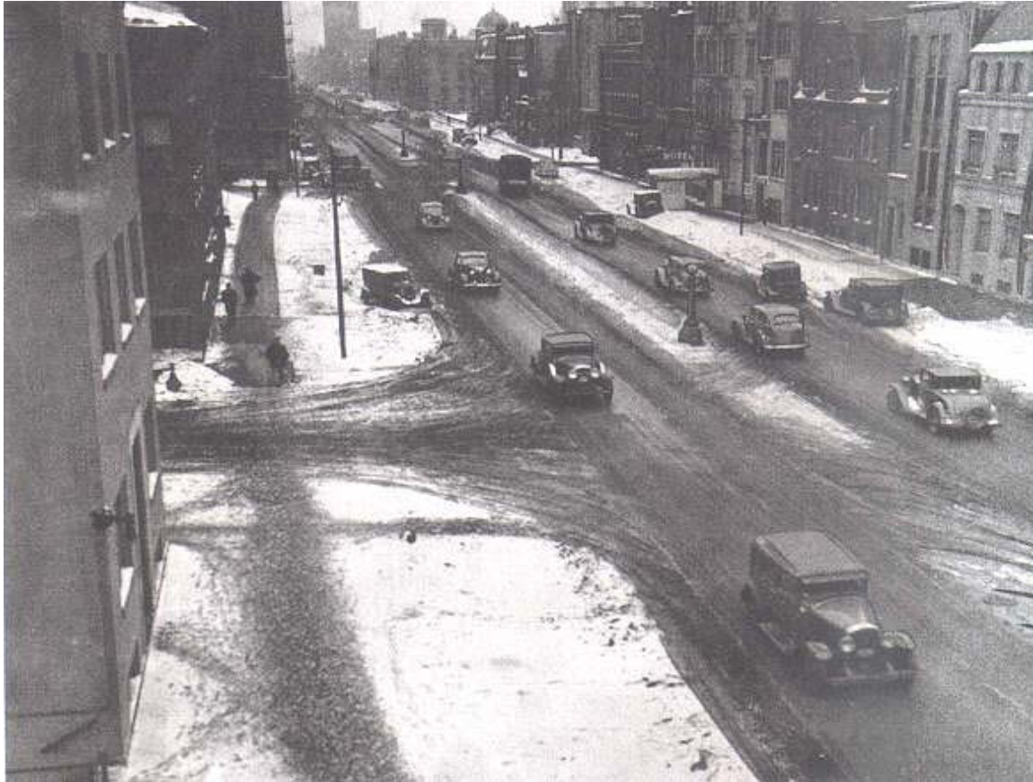
A view of the widened LaSalle Street, circa 1936. The widening of LaSalle Street in 1929 as a broad automobile-oriented thoroughfare was the impetus for the reconstruction of the Veseman Building in 1930.