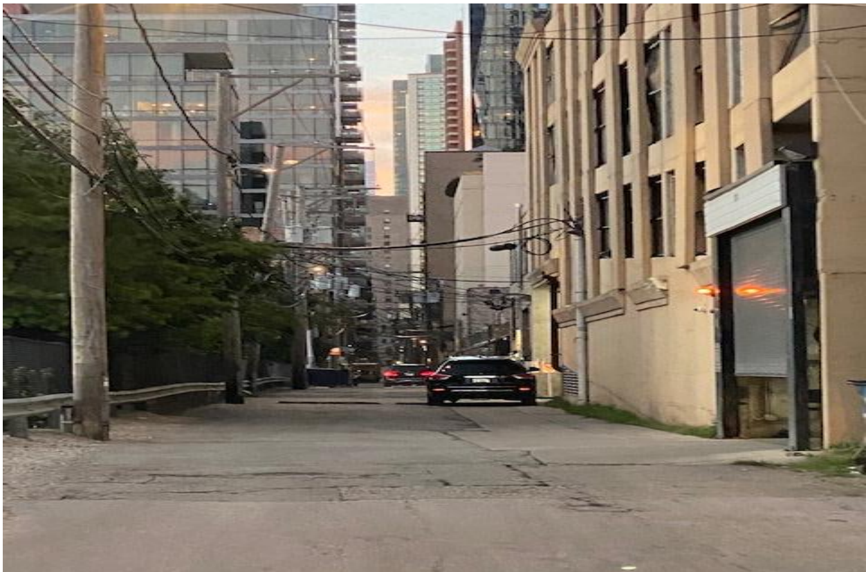
South Loop alley 08.14.21 btw Michigan & Wabash/16 th & 14 th.

Traffic in the alley was an argument... Better traffic in the alley than on the street. The below image is from a South Loop alley lined with high rises.