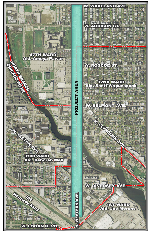
*Map Shows 2015 Ward Boundaries

Through public involvement received at these meetings, the project team reviewed input from stakeholders, studied and evaluated alternatives, and expanded the study through the development of a corridor improvement concept to fully address the various concerns.