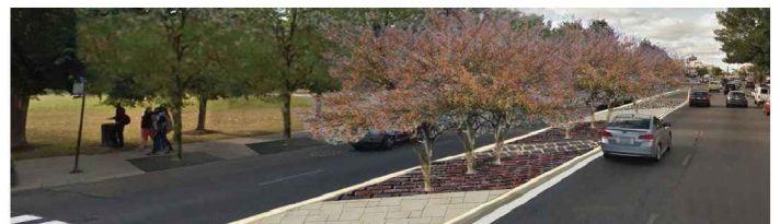
TYPICAL MEDIAN DESIGN