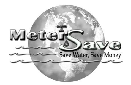
Save Water Save Money!

Please go to www.metersave.org, call 311, or 312-744-4H2O.