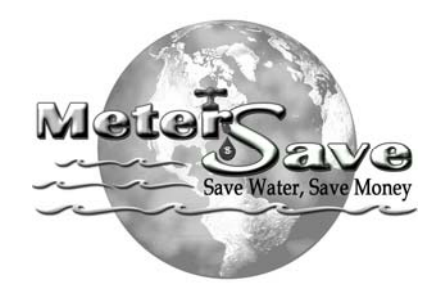
Save Water Save Money!

Please go to <u>www.metersave.org</u> By phone call 3-1-1, or 312-744-4H2O.