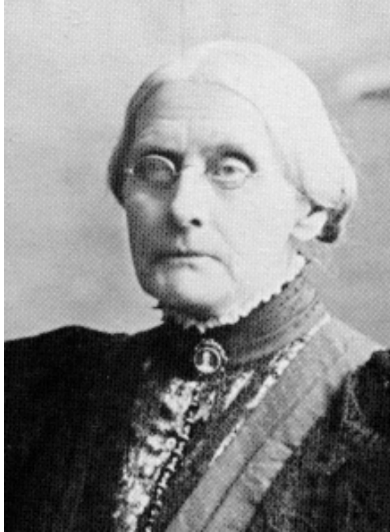
SUSAN B. ANTHONY

Do you wonder what was happening in 1906? That's the year the old water main was installed beneath your street. Among other things: