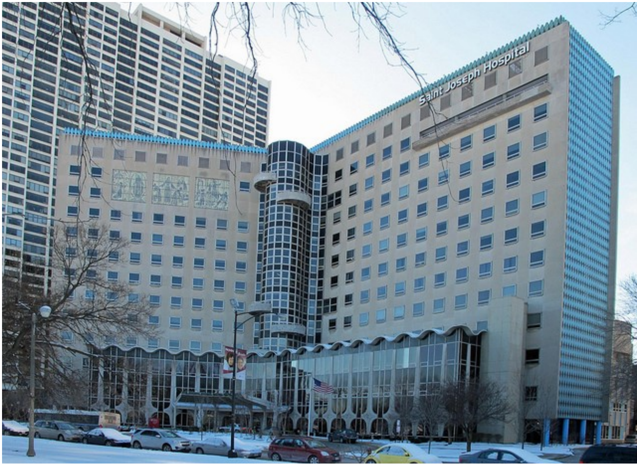
St. Joseph Hospital, Chicago (1963)

St. Joseph's is characteristic of Belli & Belli's idiosyncratic, expressive, and colorful take on mid-century modernism. The form of the building consists of three slab-like wings clad in smooth limestone punched with a grid of window openings. The wing ends are clad in an eye-catching harlequin pattern of black and turquoise blue enamel panels. The design palette also includes a tinted-glass cylindrical curtain wall that extends the full height of the front facade, and contains elevator lobbies and lounges on each floor.