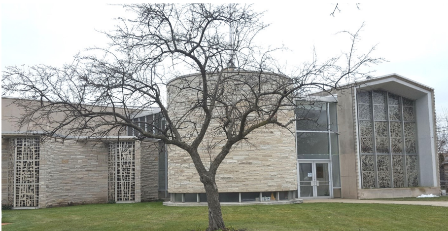
The raffle succeeded in raising funds for the nearby St. William parish to build this church, as well as a new convent and rectory, also designed by Belli & Belli in 1957.