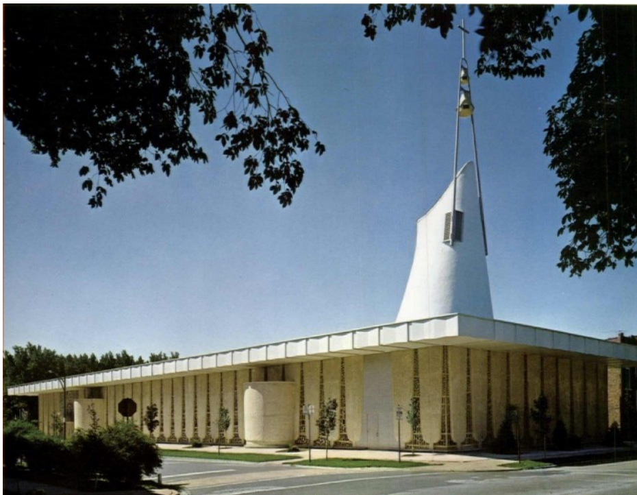
St John Bosco, Chicago (1966)

St. Joseph's is characteristic of Belli & Belli's idiosyncratic, expressive, and colorful take on mid-century modernism. The form of the building consists of three slab-like wings clad in smooth limestone punched with a grid of window openings. The wing ends are clad in an eye-catching harlequin pattern of black and turquoise blue enamel panels. The design palette also includes a tinted-glass cylindrical curtain wall that extends the full height of the front facade, and contains elevator lobbies and lounges on each floor.