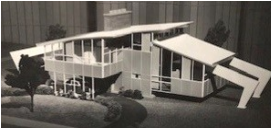
An architectural model of the house built by Belli & Belli clearly showing the unique structural system that suspends the house from bridge-like trusses. The structure allowed the architect to reduce load-bearing walls and columns and open up the house to more light and free-flowing interiors.