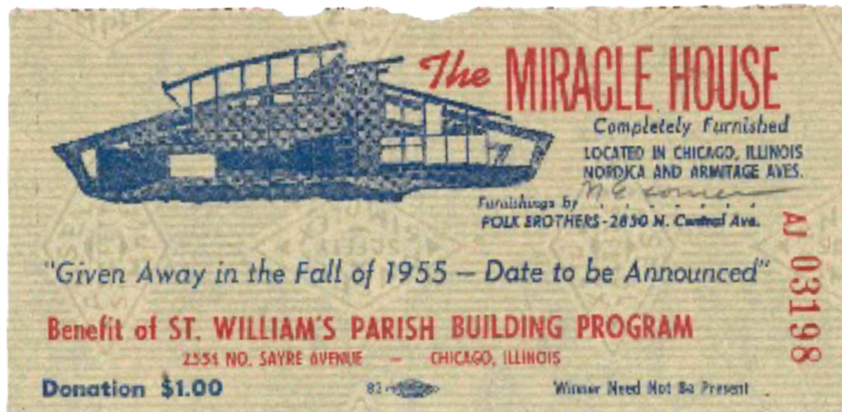
A raffle ticket from which the house derived its name. Purchasers were entitled to a tour of the house in the months leading up to the drawing.