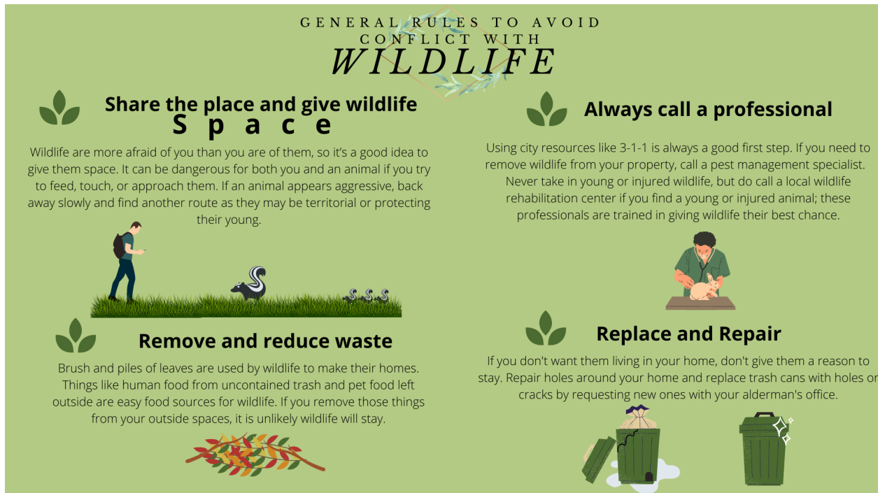
Figure 16 Lincoln Park Zoo, Urban Wildlife Institute

Chicago is a unique city, home to many forms of wildlife. Understanding how to cohabitate with these creatures is necessary to drive coexistence. Appropriately navigating direct encounters and avoiding potentially negative future events is, therefore, crucial. Some helpful rules include: giving animals space when you see them, eliminating waste and repairing damage on your property, and contacting professionals in cases of wildlife related problems. Local wildlife offer opportunities to experience nature in the city and understanding how to share space will ensure that we promote positive interactions.