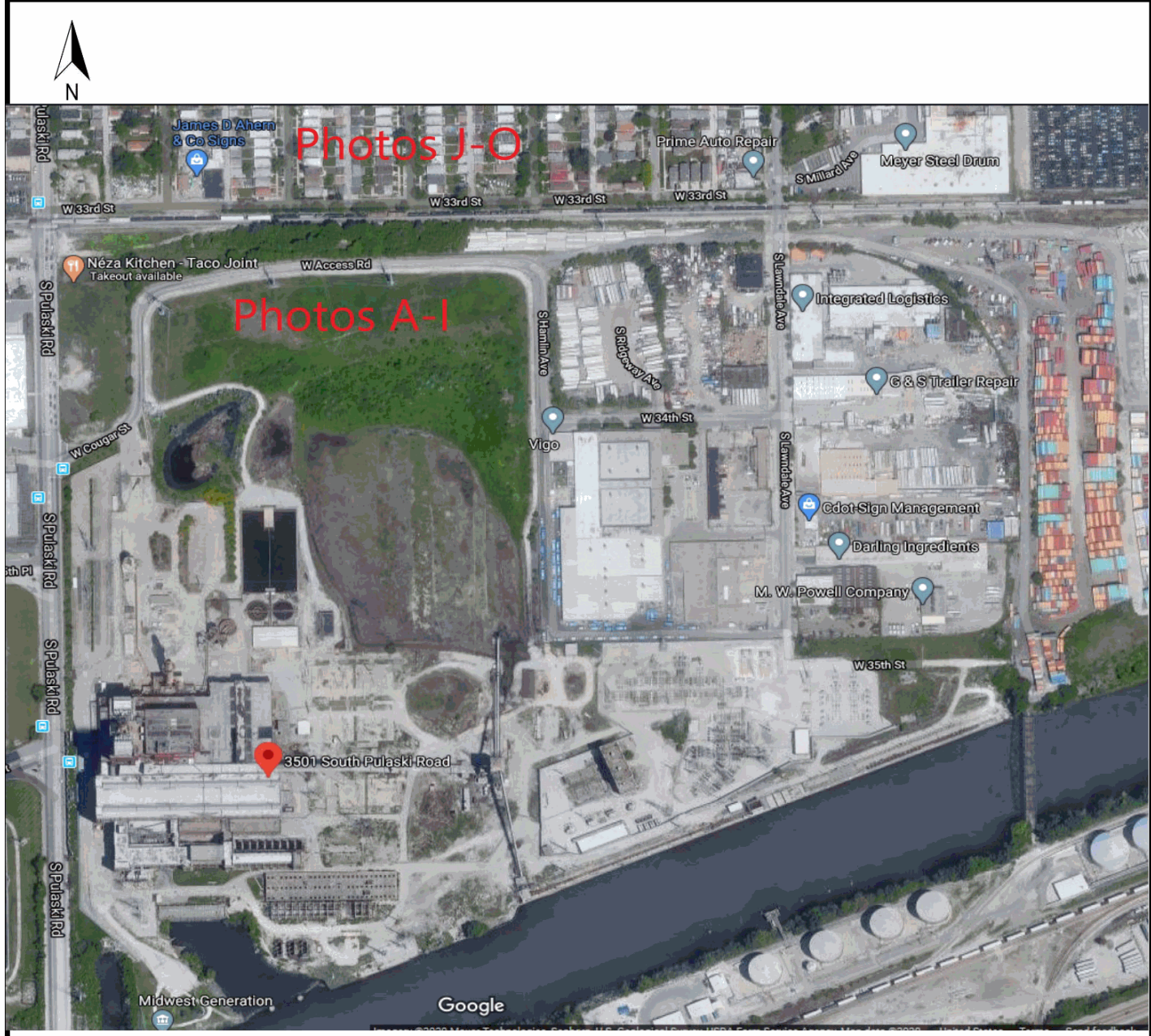
***Not drawn to scale. Aerial imagery may not be representative of actual site conditions at the time of inspection.