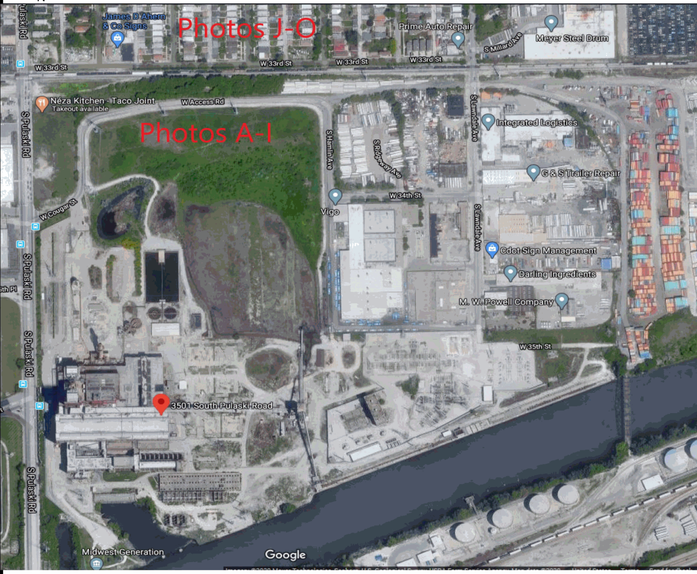
***Not drawn to scale. Aerial imagery may not be representative of actual site conditions at the time of inspection.