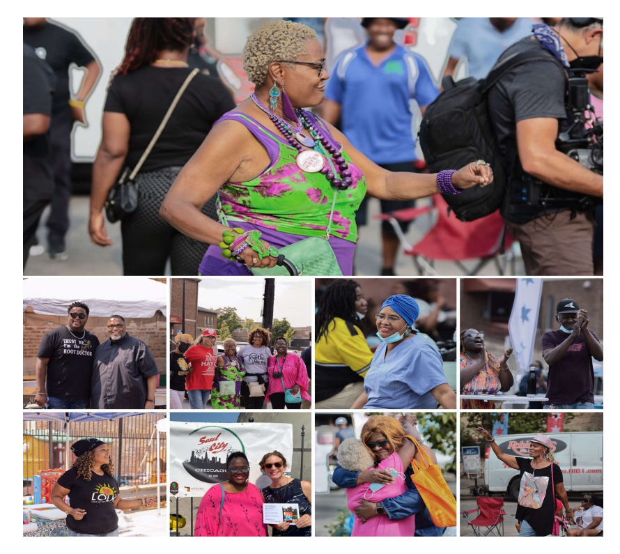
Celebrating Art & Music in Soul City