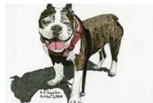
"French Bulldog" by RJ Juguilon $150.00