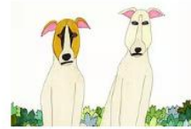
"Brothers" by Stephon Doby Out of stock