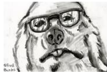
"Smart Dog" by Alfred Banks Out of stock