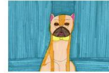
"Formal Frenchie" by Stephon Doby $30.00