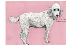
"Poodle" by RJ Juguilon Out of stock