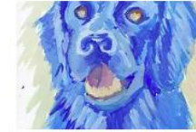
"Blue" by David Hence $30.00