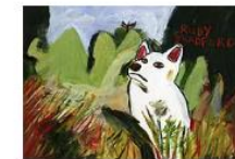
"Dog Meets Butterfly" by Ruby Bradford $75.00