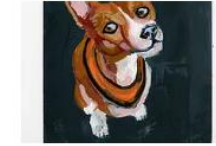
"Little Dog" by David Hence $40.00