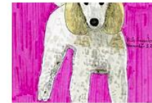
"Standard Poodle" by RJ Juguilon Out of stock