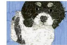
"Cocker Spaniel Puppy" by RJ Juguilon $75.00