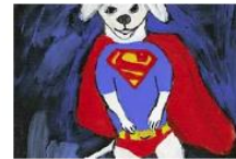
"Superdog" by Ruby Bradford $75.00