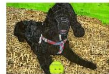
"Ball is Life" by RJ Juguilon $100.00