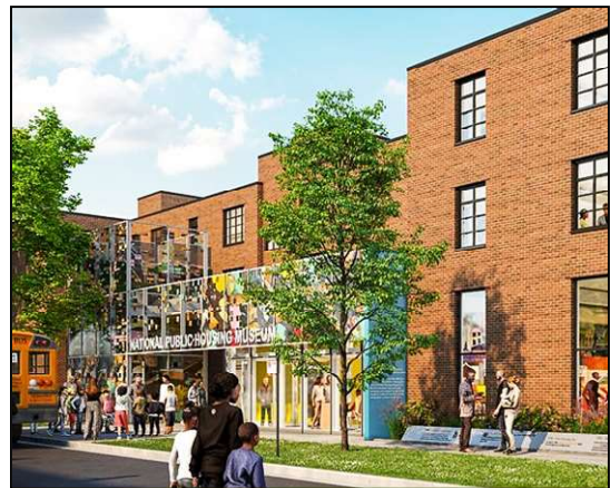
National Public Housing Museum

When completed, the Roosevelt Square development will include 2,441 units of mixed-income housing and 75,000 square feet of retail/commercial space, constructed in six phases. To date, 664 residences have been brought online, including both rental and sale units, as well as 30,000 square feet of retail and a 15,000-square-foot public library branch.