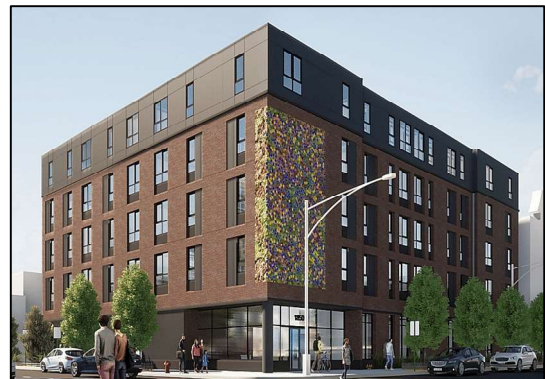
1850-54 S. Racine

The developer is The Resurrection Project (TRP), a non-profit housing provider and social-service agency that began as a grassroots advocacy organization committed to building community ownership and wealth. Since its founding in 1990, TRP has developed and/or manages 500 units, both rental and owner-occupied, and currently operates two day-care facilities, a senior center and various commercial spaces.