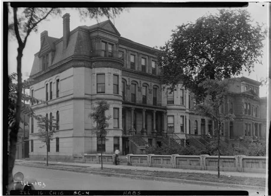
Development in the community flourished following the opening of the Union Stock Yards, just west of Oakland, in 1865. New residents flocked to the area because of its proximity to the Union Stock Yards, Camp Douglas, and a commercial district which included numerous popular saloons. Pictured above is the commercial corridor along Pershing Road at Cottage Grove Avenue. Below is a view of the opulent residences of Aldine Square (demolished). Constructed in 1874, between 37th and 38th Streets and Vincennes and Eden Avenues, Aldine Square represents the typical housing stock which lined Oakland's streets and served as residences for elite Chicagoans.