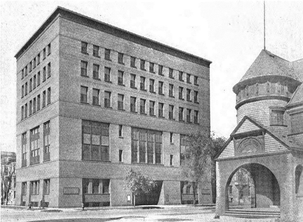
Development in Oakland was also spurred by transportation improvements including the opening of the Illinois Central Railroad terminal at 39th Street and Cottage Grove Avenue in 1881, pictured above (Ryerson and Burnham Archives). The bottom photograph depicts the Abraham Lincoln Center (located at the northeast corner of Langley Avenue and Oakwood Boulevard) which opened in 1905 as a meeting place for people of various races, religions, and nationalities (Abraham Lincoln Center 1913 Annual Report).