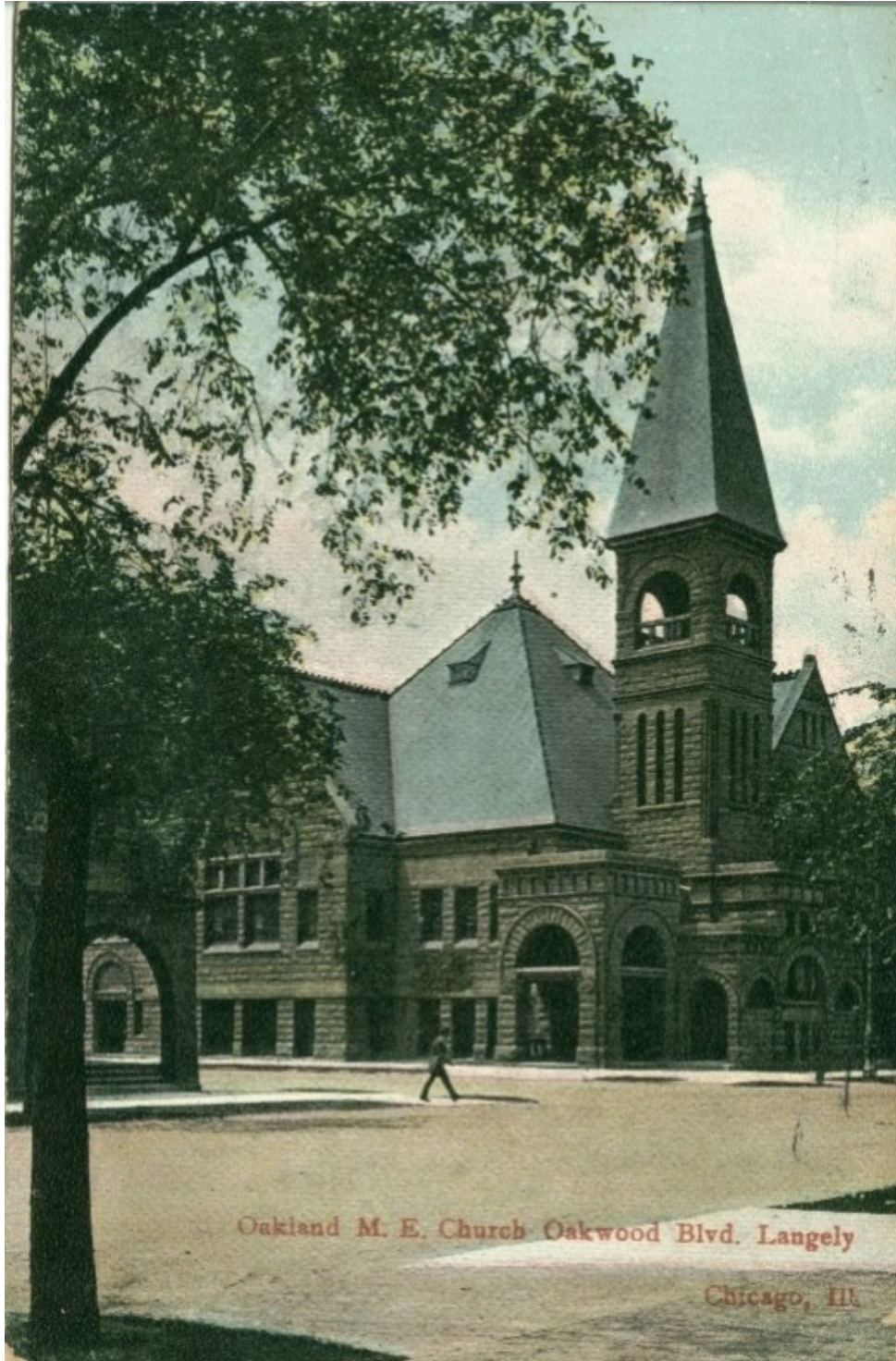
Constructed in 1886 for the Oakland Methodist Episcopal Church the building was designed by the prominent national architectural firm of Edbrooke and Burnham in the Romanesque Revival style. The new church featured a second-floor sanctuary with dedicated educational, performance, and meeting spaces in a community center on the first floor. The pictured photograph was taken in 1911 from the Abraham Lincoln Center at the northeast corner of Oakwood Boulevard and Langley Avenue looking southwest.