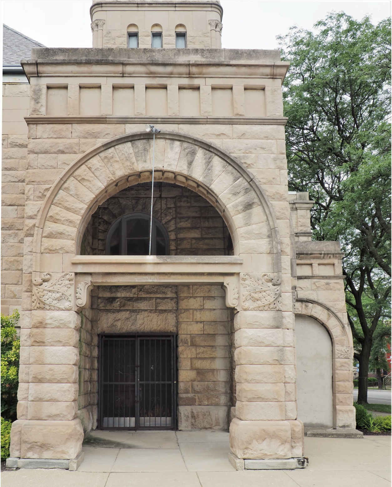
The double-arched portico to the east of the main entrance bay features round-arched openings and a paneled cornice. Profiled limestone lintels supported by acanthus-ornamented brackets span the bottom of the arches.