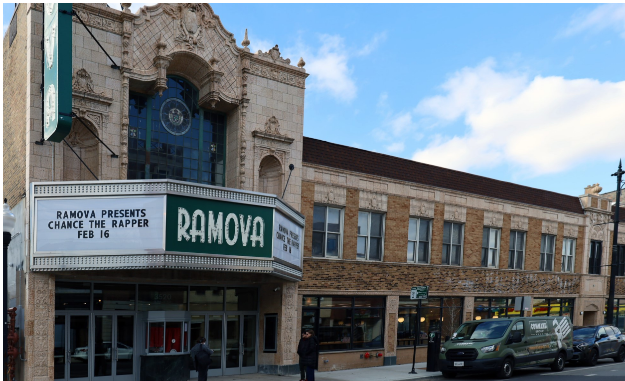
Current view of the Ramova Theater looking north on South Halsted Street. The theater's façade at left is from 1929. The commercial wing at right was built in 1912, then a story and a new façade were added in 1929 to compliment the theater.