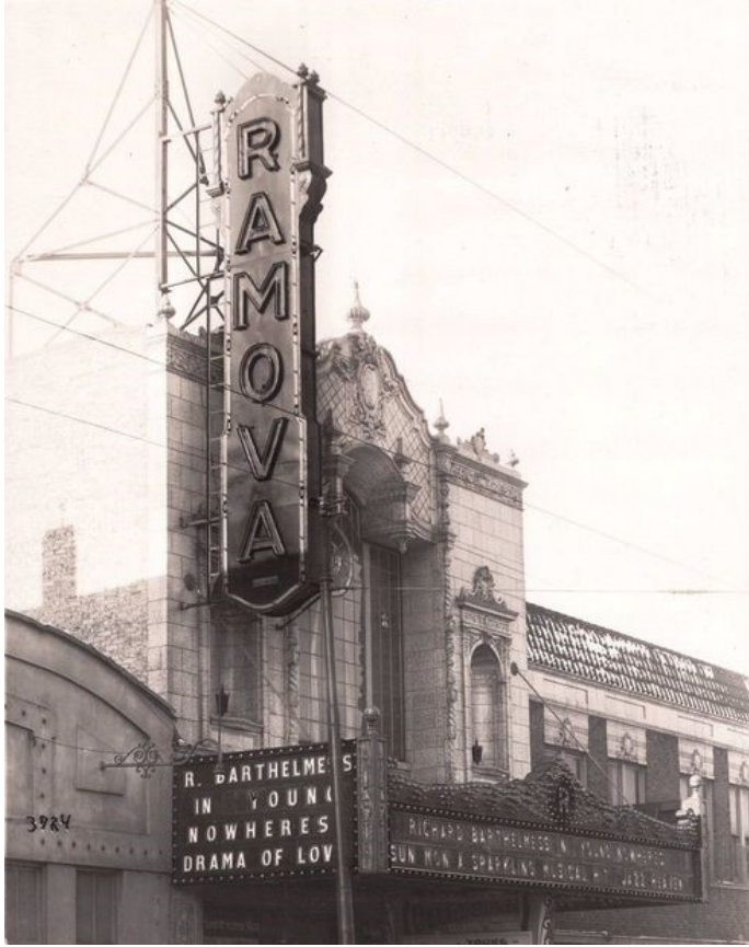
Left: Ramova Theater entry with historic blade sign and projecting marquee, 1930.