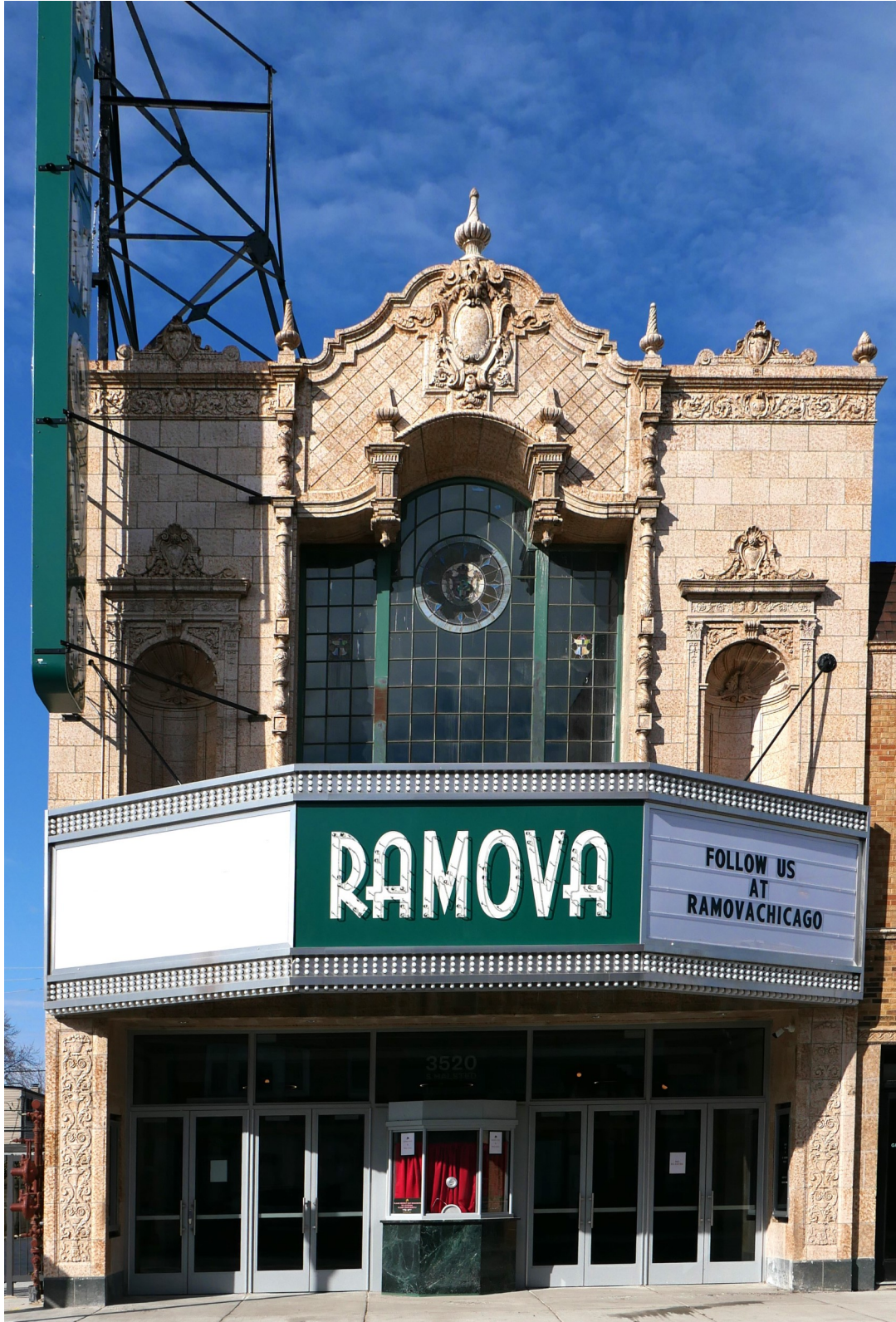
The façade of the theater combines an elaborate Spanish Baroque façade in terra cotta with a marquee and blade sign from 1944.