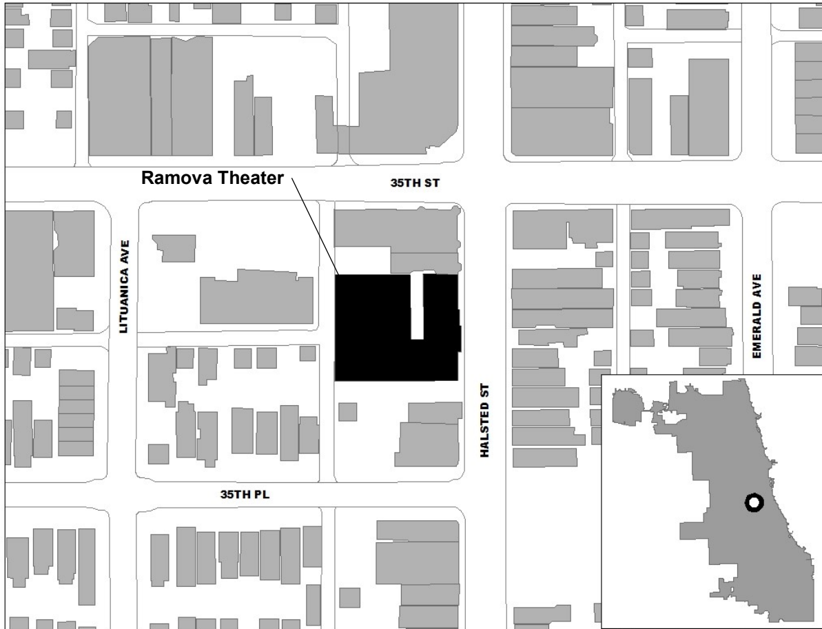
The Ramova Theater is located mid-block on South Halsted Street south of 35th Street in the commercial heart of the Bridgeport neighborhood.