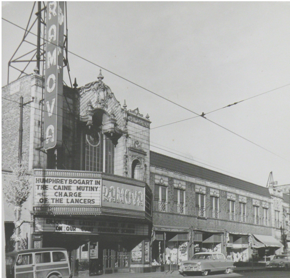
1954 view of the Ramova Theater.

"Who's Who in Bridgeport," Bridgeport News , April 11, 1940: 6.