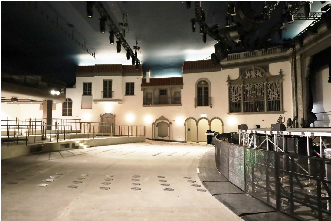
The theater lobby (above) and auditorium (below) have been completely restored in 2023 after decades of neglect and water infiltration. Both spaces continue the Spanish theme of the exterior to create the atmosphere of a Spanish courtyard rendered in decorative plaster. The auditorium has been converted from a motion picture theater to a performance venue requiring the removal of seating, floor leveling, a new stage and stage lighting.