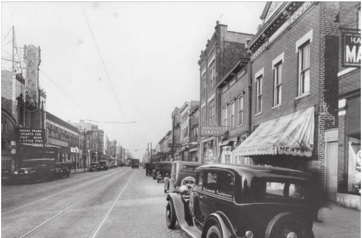
Below: Theater and commercial blocks, facing north on S. Halsted Street, 1933.