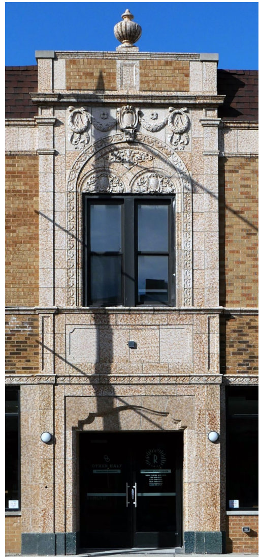
Above: the commercial block of the building includes 5 storefronts and an entrance bay.